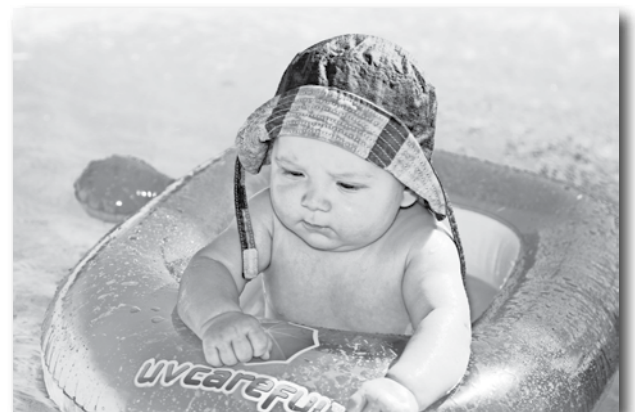
Swimming pool fun.