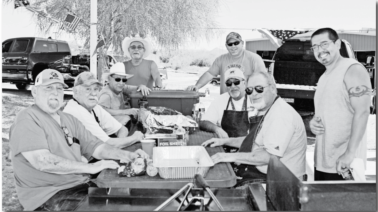
Superior Red Bear Outfitters pose for a picture.