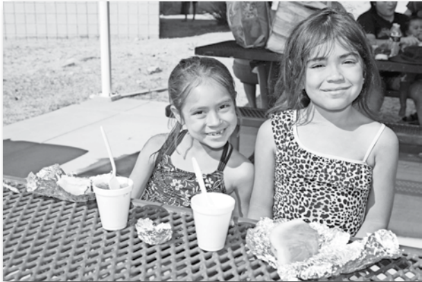
Having a meal at the pool.