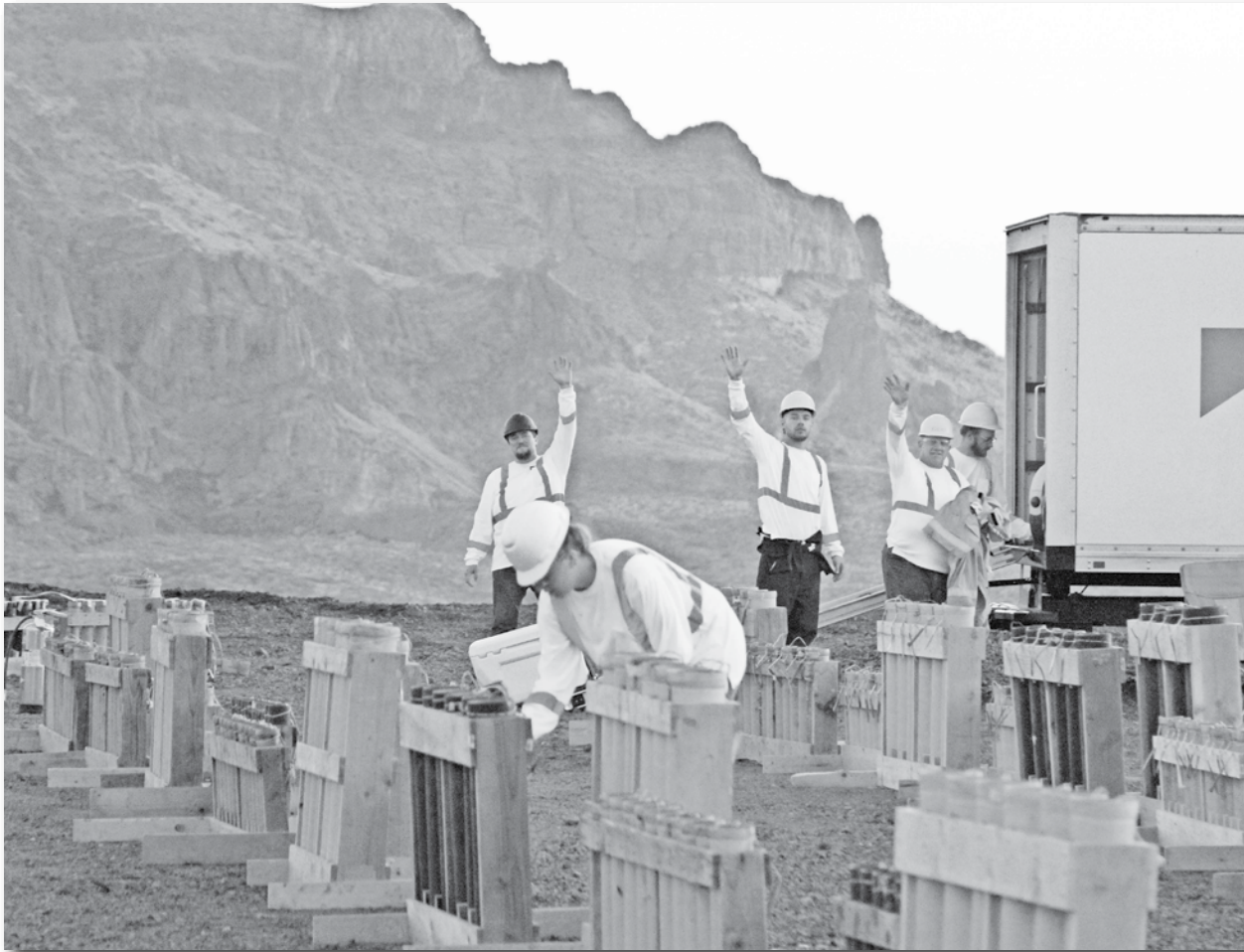
Southwest Fireworks Team take time to wave at the camera.