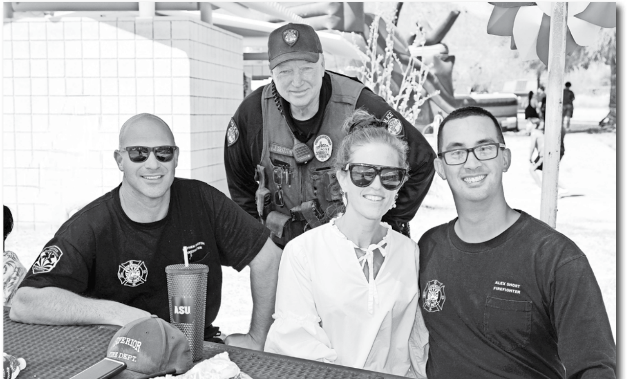
Members of the Superior Fire Department and Police Department at the July 4th event.