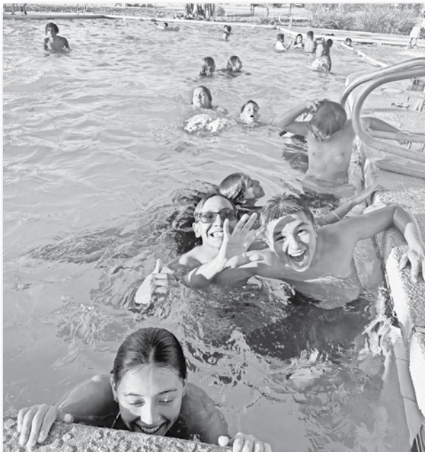
Swimming pool fun.