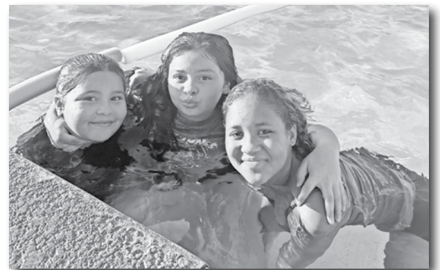
Swimming pool fun.