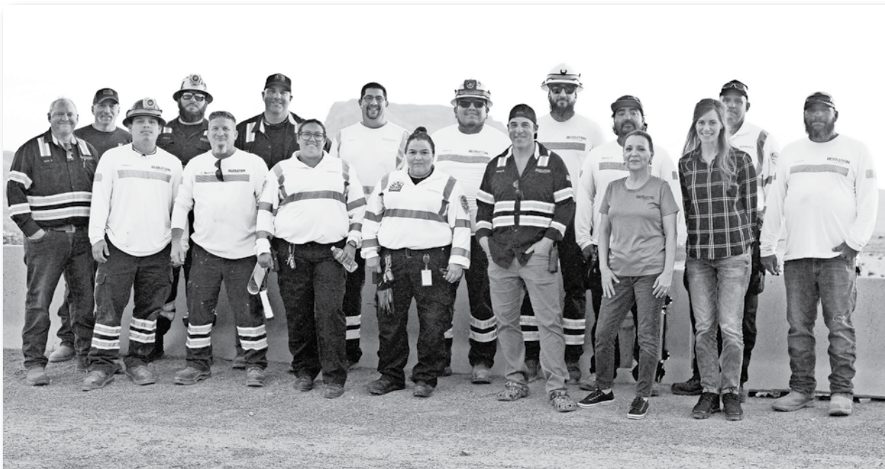
Resolution Copper Team.