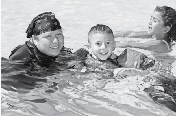
Swimming pool fun.

Supporting the event were Red Bear Outfitters, OMYA, VFW Truman Post and the Town of Superior Youth Council.