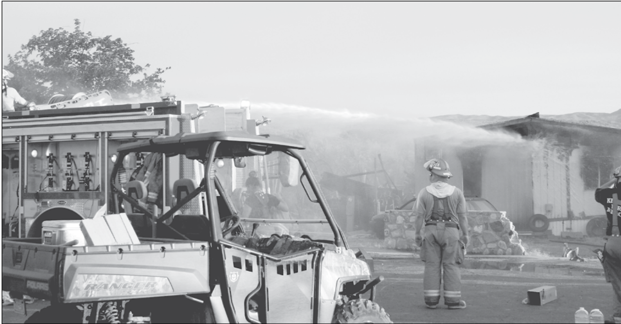
Kearny and Hayden Firefighters worked to extinguish the fire which destroyed a trailer in Kearny Thursday.

Kearny Fire Department responded to multiple reports of a brush fire located in a ravine between the railroad tracks and homes on Jamestown Circle and Ivanhoe Rd. in Kearny.