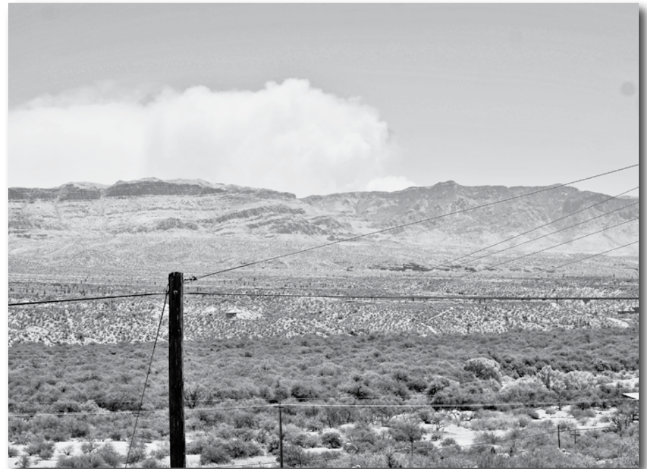
Smoke can be seen rising above the Galiuro Mountains from the Oak Fire, burning since June 17.

On the night of June 24, a backing fire along a ridge line in the Kennedy Peak area was ignited by a helicopter dropping fuel filled spheres which ignite upon impacting the ground. The ridge line was set on fire to allow it to back down to the lower elevations. Backing fires usually burn more slowly and with less intensity than fires burning uphill, resulting in minimal effects to mature trees while burning off the lower ground fuels. If you would like more information about the fire including a map of the area fire, visit inciweb.nwcg.gov .