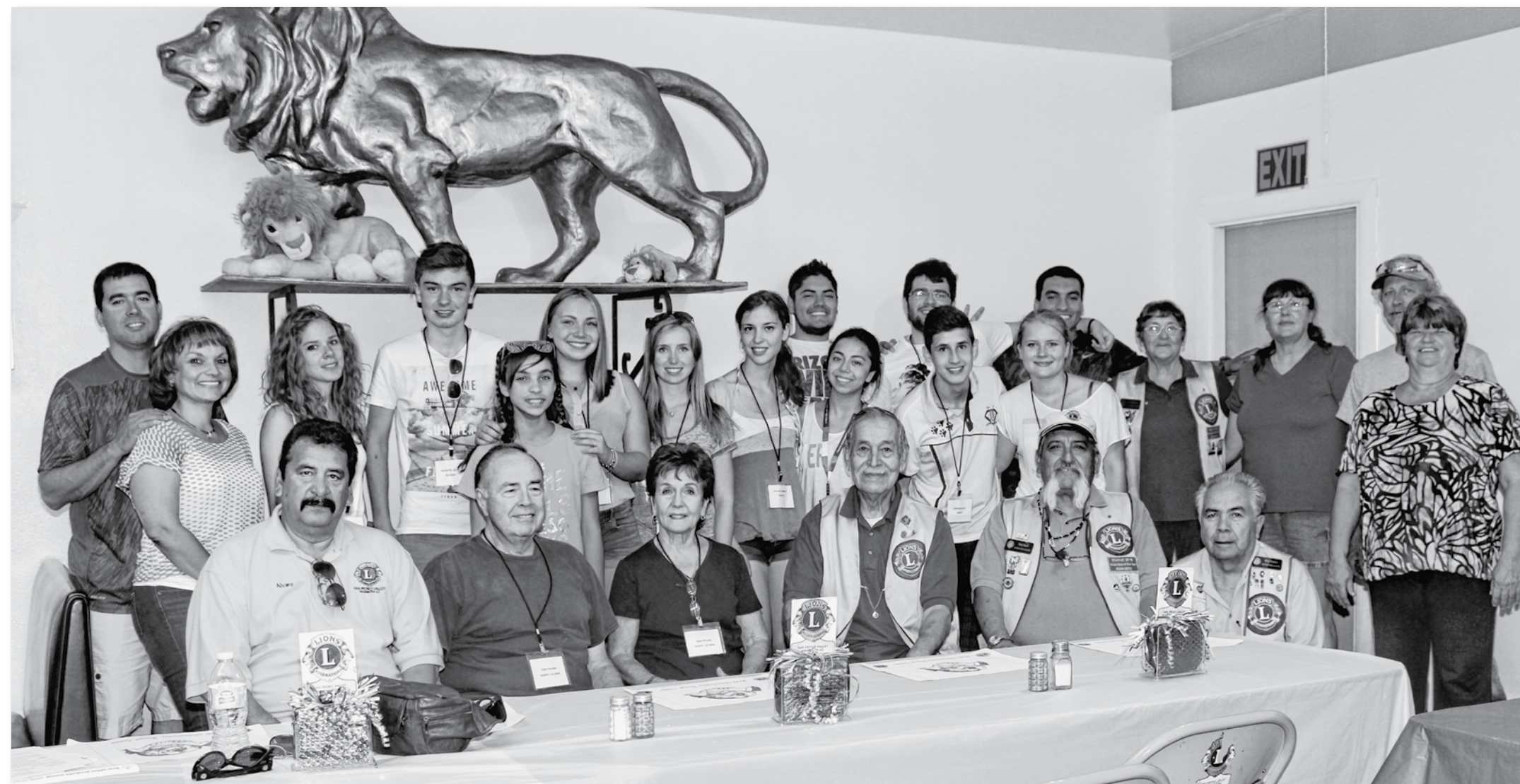
Members of the San Pedro Valley Lions Club in Mammoth are pictured with their local and international guests Saturday.