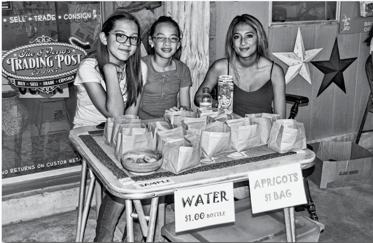
Tables are set up at Sue and Jerry's Trading Post on Wednesdays at the Oracle Farmers Market.