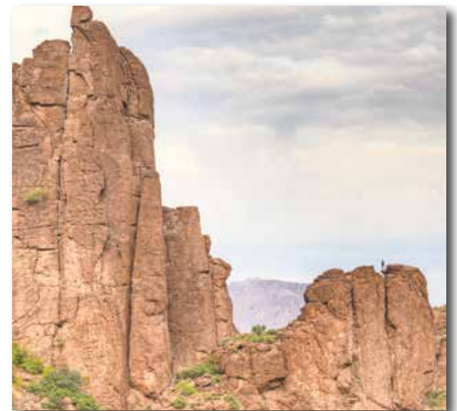
Local photographer, author and social media influencer Cat Brown captured video and photographs of climbers tackling the challenges of Queen Creek canyon. Follow her on Instagram: @aroundsuperioraz.

Recently the Town released the new tourism logo with tagline “adventure elevated”. Be on the look out for more promotion of Superior as a safe place for physically distant recreation.