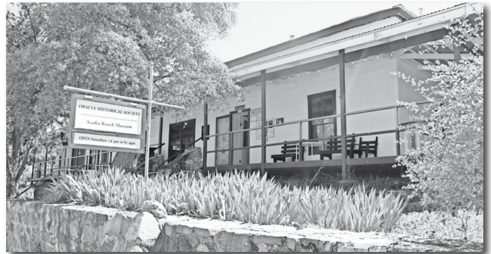
The Oracle Historical Society's Acadia Ranch Museum has been closed to the public due to the current pandemic.

This grant ensures that OHS will continue to operate, and fulfill its mission to document and preserve this area's rich history. OHS is extremely grateful to AzH and NEH for their ongoing support and generosity, and look forward to opening its Acadia Ranch Museum, American Flag Ranch and Trowbridge Tack Room to the public soon.