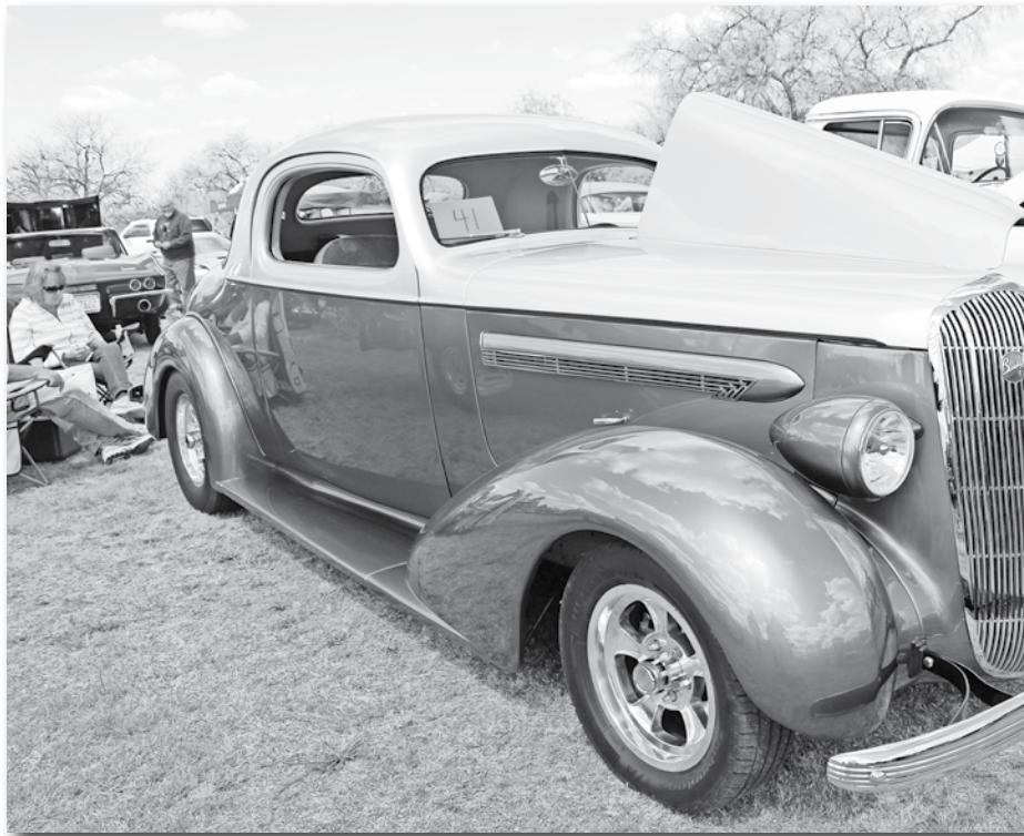
The COVID-19 pandemic forced the cancellation of two major fundraisers for the Oracle Historical Society: the Oracle Spring Run Car Show and the Oracle Run.

RECENTLY ENDORSED & RECOMMENDED BY THE CASA GRANDE VALLEY NEWSPAPERS INC. PREVIOUSLY ENDORSED BY FORMER GOV. JANET NAPOLITANO