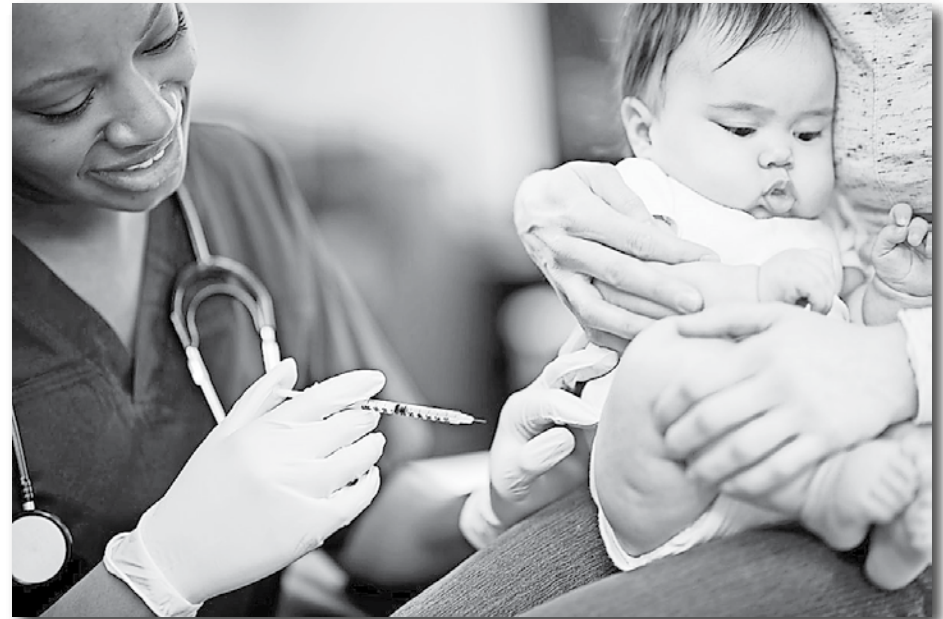
First Things First, Arizona’s early childhood agency, is working with early childhood partners to urge families to keep their babies, toddlers and preschoolers on schedule for their immunizations.