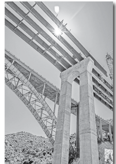
Pinto Creek Bridge, the old and the new, side by side.

Motorists with a destination between SR 177 and Top-of-the-World to the west of Pinto Creek, or between Miami and Pinto Valley Mine Road east of Pinto Creek, will be allowed to pass during the closure. No vehicles will be allowed between Top-of-