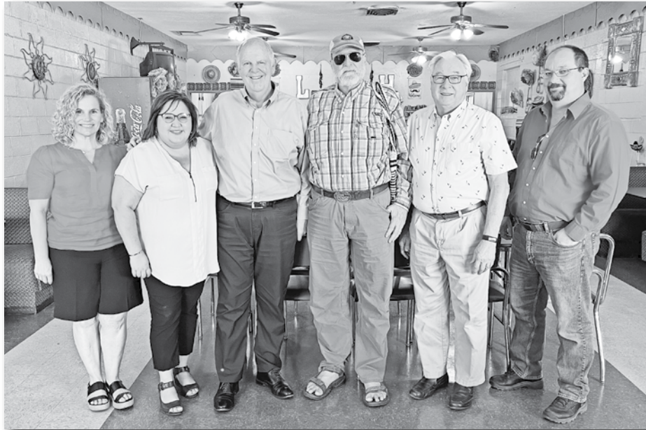
Local leaders met with Congressman Tom O'Halleran last week to discuss the state of the town and the new Multi-Gen Center in Superior.

O'Halleran and his staff also met with leaders in Hayden and Winkelman during his visit to catch up on their needs as well.