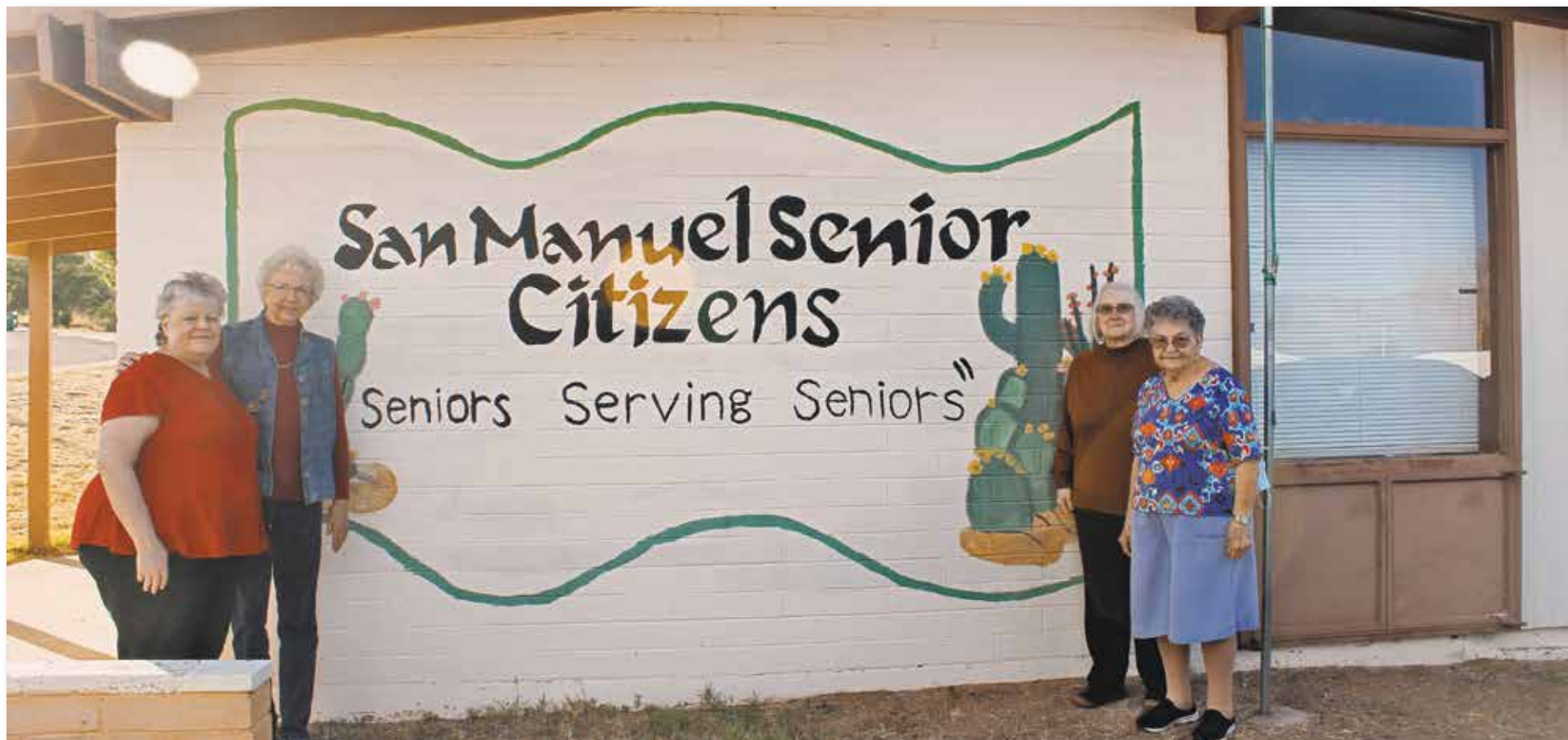
The San Manuel Senior Center will be the recipient of CDBG funds from the county.