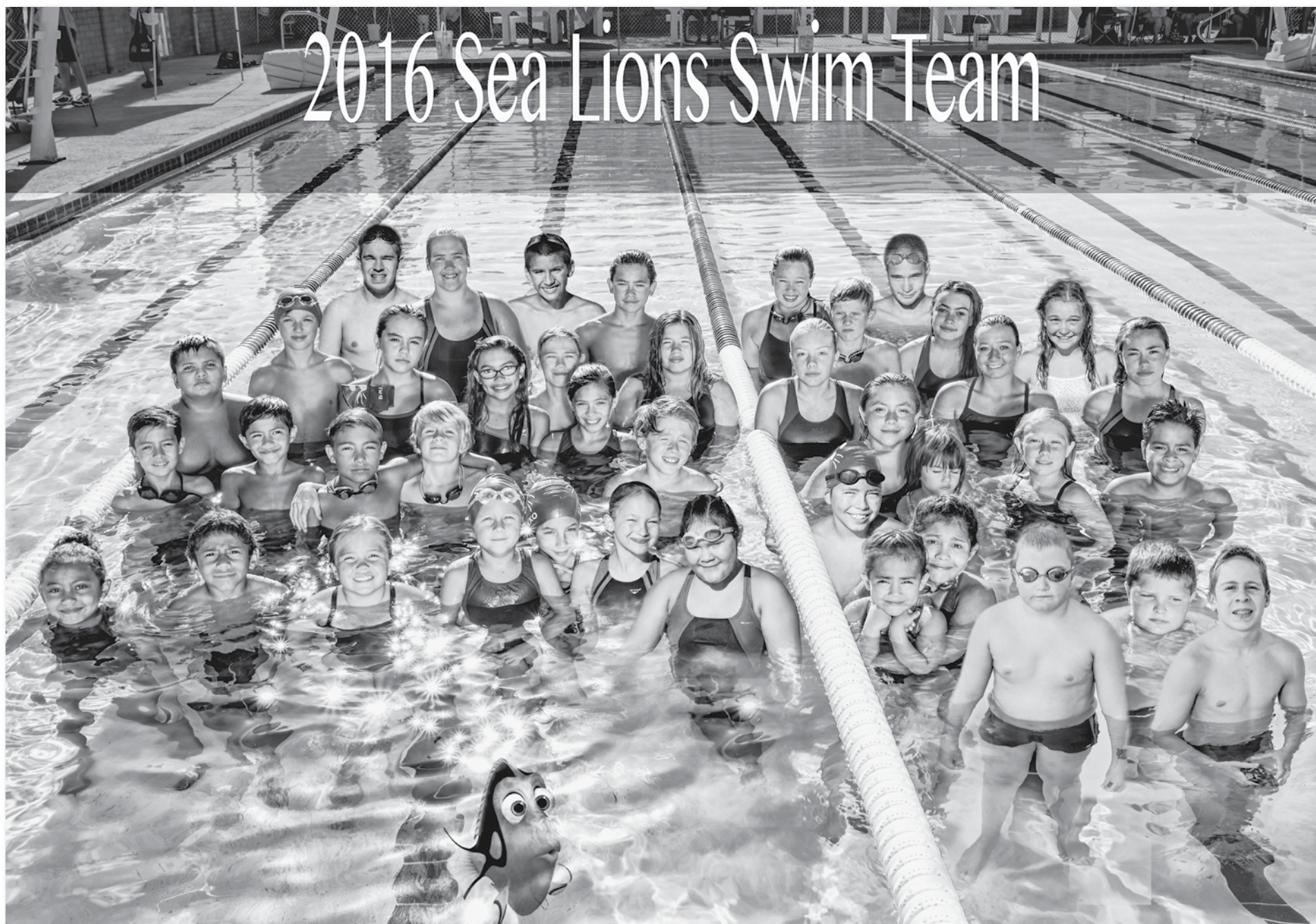
The 2016 Sea Lions Swim Team are champions again for the 10th year in a row. They even found Dory! Way to go, wet ones!