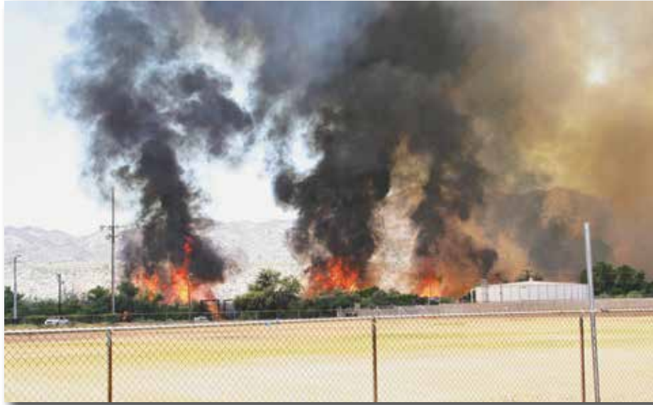
The Kearny River Fire last year burned fast and hot thanks to salt cedar bushes growing along the Gila River.