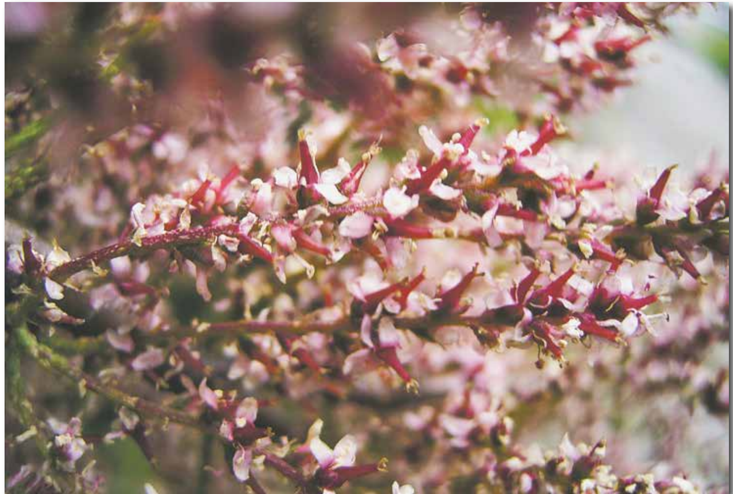
Despite their beautiful blooms, tamarisks or salt cedars are detrimental in so many ways to the Arizona deserts as evidenced in last year's Kearny River Fire.