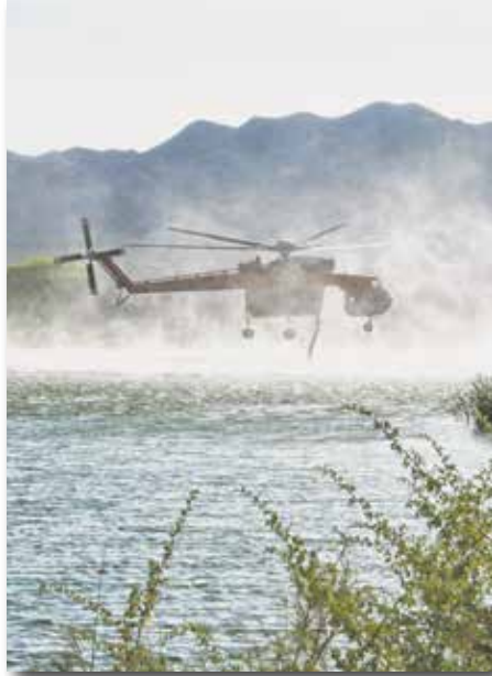
Mitigation of salt cedars may help prevent future fires.