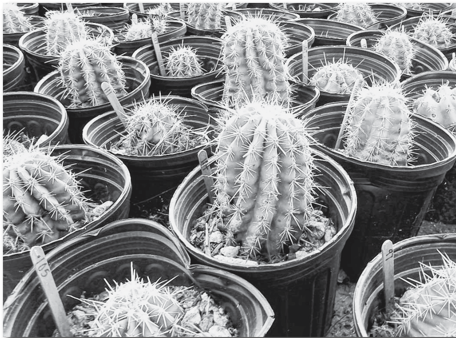
Approximately 1,000 endangered Arizona Hedgehog cactus grown on Resolution Copper's JI Ranch were collected and replanted.