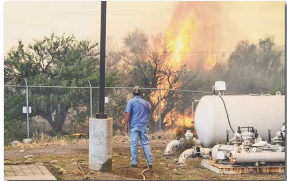
Salt Cedar fires burn fast and hot and against the wind.