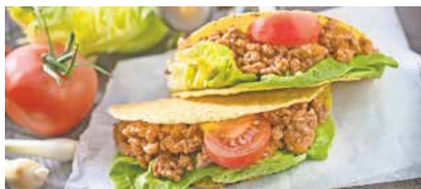
Beef Taco Meat Seasoned Chunks $5.99/lb

TWO SUMMER GRILL GRAB & GO MEAT BOXES $99 EA