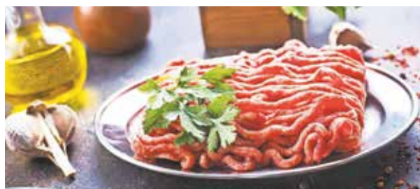
Ground Beef Family Pack · 73/27 Grade $2.99/lb