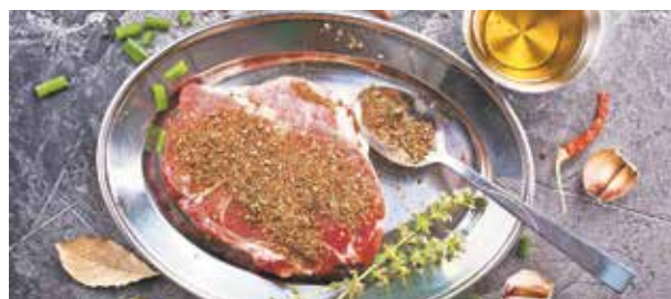
Seasoned Pork Chops Adovada Style · Family Pack $1.69/lb