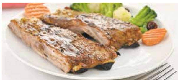
Pork Country Style Ribs Seasoned · Family Pack · Ready to Grill $1.49/lb