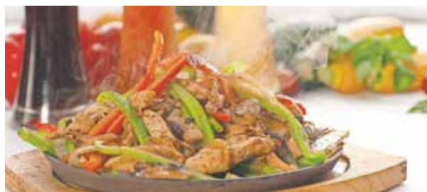
Beef Fajita Meat Marinated Steak Strips $5.99/lb

Beef Carne Asada ..... $5.39/lb Marinated Thin Cut Beef Steaks