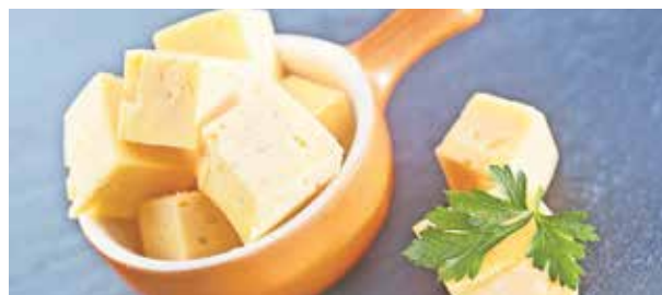
Mild Cheddar Cheese Block Cuts $2.99/lb