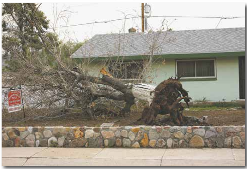
Monsoon winds blew through Kearny on Wednesday, July 19, knocking down trees and fences and sending sheds soaring into the sky.