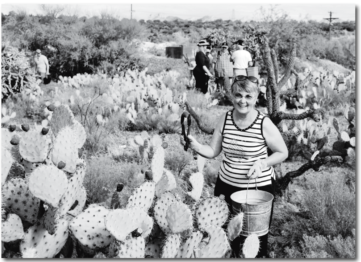
Prickly pear pickers at last year's Prickly Pear Festival.