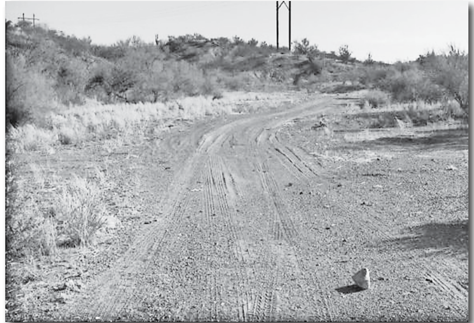
Dudleyville Gun Range – After.

High School students (10th - 12th) can jump start their careers by enrolling in CVIT's Central Campus Programs located on Gila Community College or Central Arizona College Aravaipa campuses. All tuition, books, and certification fees are paid for by CVIT. Students can earn college credit and industry certification while learning entry level skills.