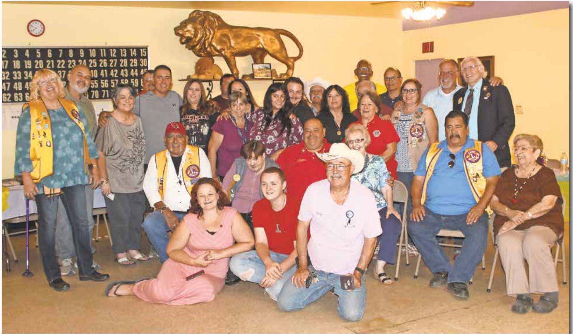
Check out all the new faces in the ranks of the San Pedro Valley Lions Club.