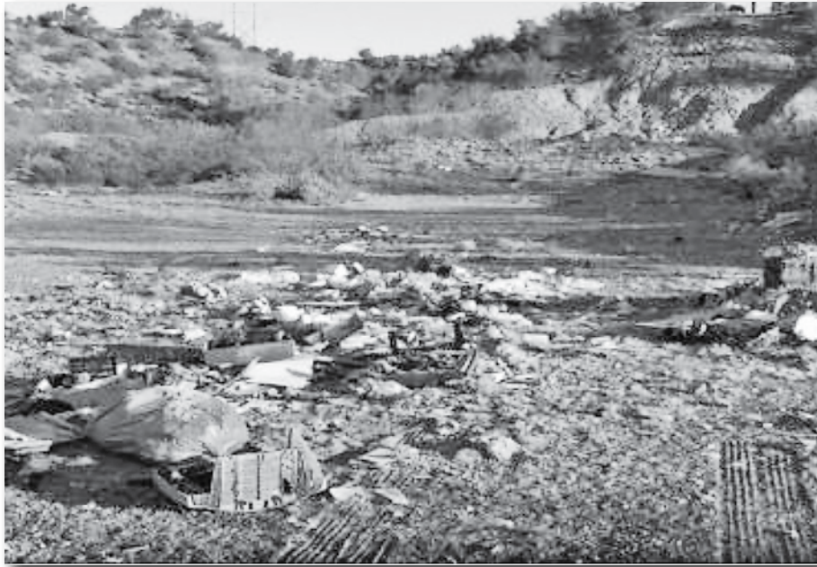
Dudleyville Gun Range – Before.

For more information regarding the waste voucher program please contact Rios' office at 520-866-7830 or 520-487-2941.