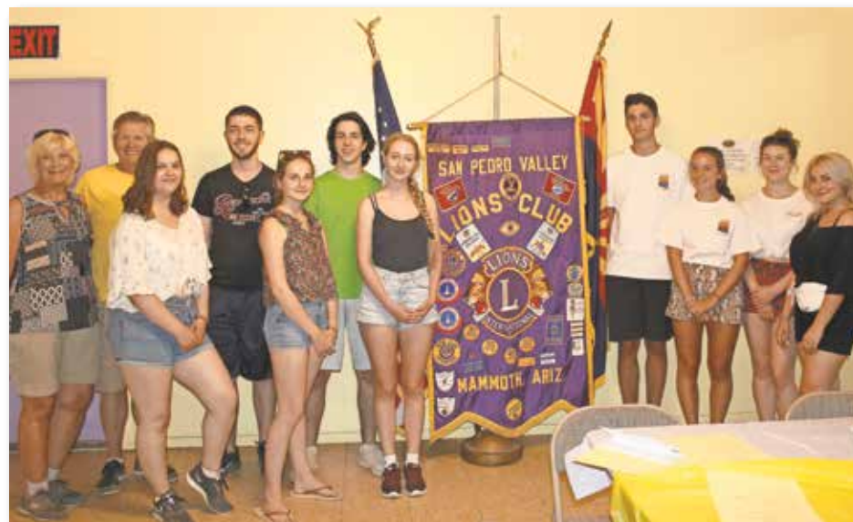
Students participating in the C. Kirby Smithe Lions International Youth Exchange program with their chaperones. This is the sixth year for the program. The students visited earlier this month.

For a Schedule of Anniversary Events Visit: CentralAZ.edu/50