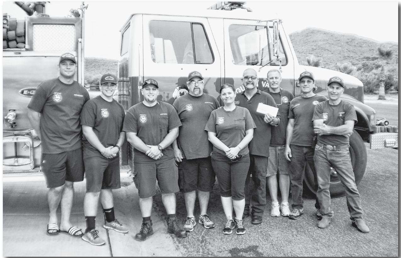
The Queen Valley Fire District are excited about a $25,000 donation from Resolution Copper Company.

The clinic is located at 1134 Highway 60 in Superior. "Our Mission is Your Health."