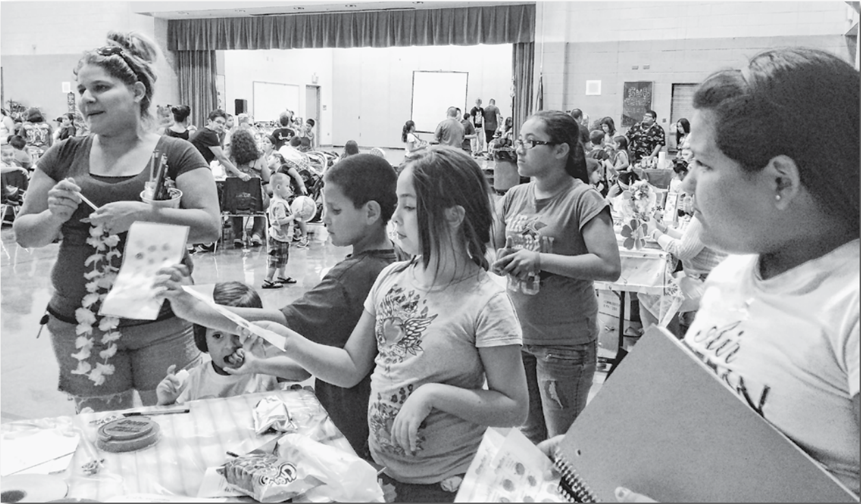
Students (and their parents) spent a lovely Friday learning about ways to prevent substance and other abuses while earning back to school supplies. Later they had fun at the pool at the Superior Substance Abuse Coalition's annual Win to Swim.