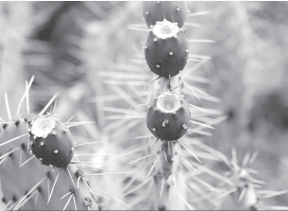
Prickly Pear Cactus with fruit.

The vivid magenta fruit of prickly pear cactus, a colorful margarita mixer, is also a juicy ingredient employed by many creative cooks, in everything from smoothies to barbecue sauce. The ripened fruit can also simply be eaten raw, right off the plant. There are many delicious ways to prepare and enjoy this delightful staple of Mexican cuisine. How, though, do you harvest these abundant desert fruits without your hands becoming a virtual porcupine of painful cactus spines and glochids? Local author Jean Groen is an expert in the arts of cactus cuisine, and kicks-off the annual summer series of prickly pear classes at Boyce Thompson Arboretum on Sunday, July 27, 9:30 a.m -10:30 a.m. All ages are welcome to participate in her informal outdoor class, which is included with BTA daily admission of $10. No pre-registration is required.