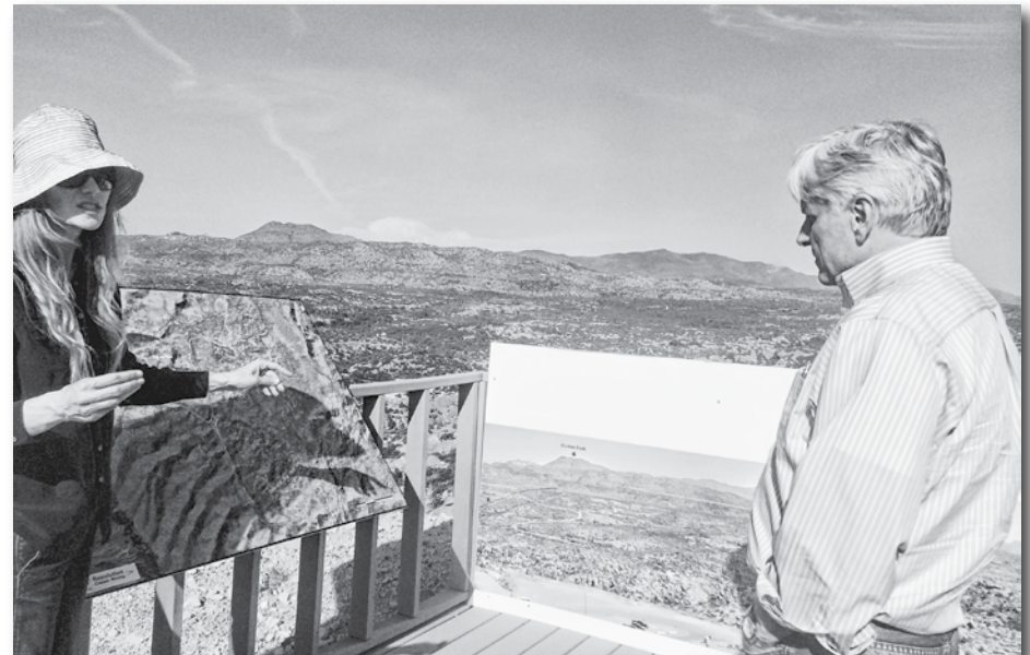
Democrat Gubernatorial candidate Fred Duval learns more about the Resolution Copper Project.