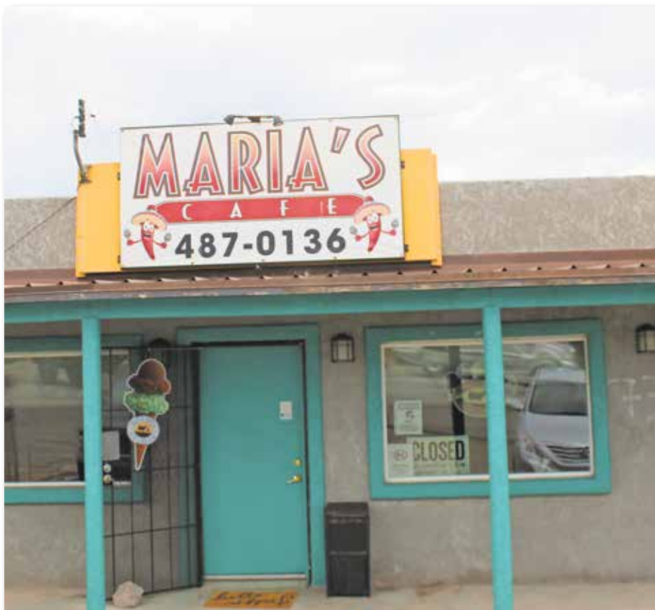
Maria's Cafe is located at 739 N. San Pedro Rd. in Mammoth on Hwy. 77.