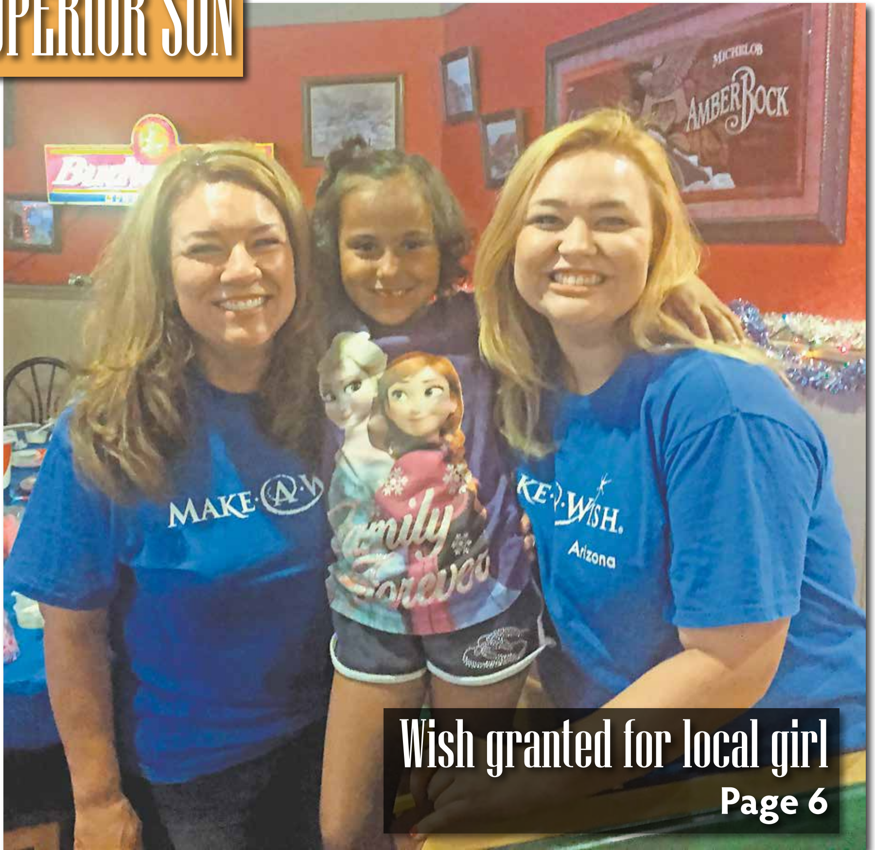
Wish granted for local girl Page 6