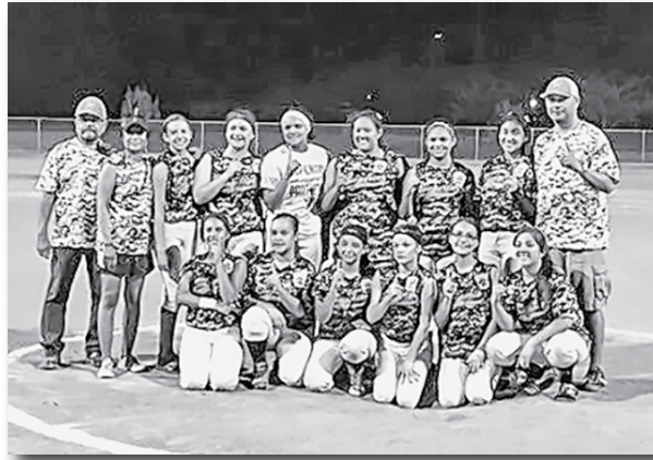
Superior Senior Softball All Stars

Still, finishing the season as the District 4 champions and Arizona State Runner-up made for an exciting summer for the team and its fans.