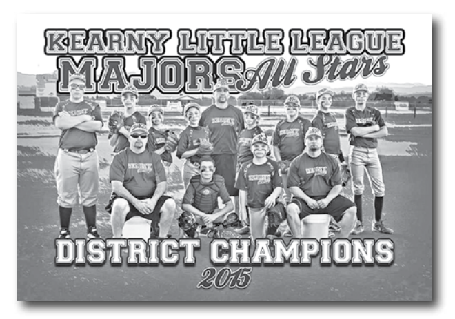
2015 Kearny Majors All-Star Team

Thank you Kearny Majors Baseball All-Stars for a great season!