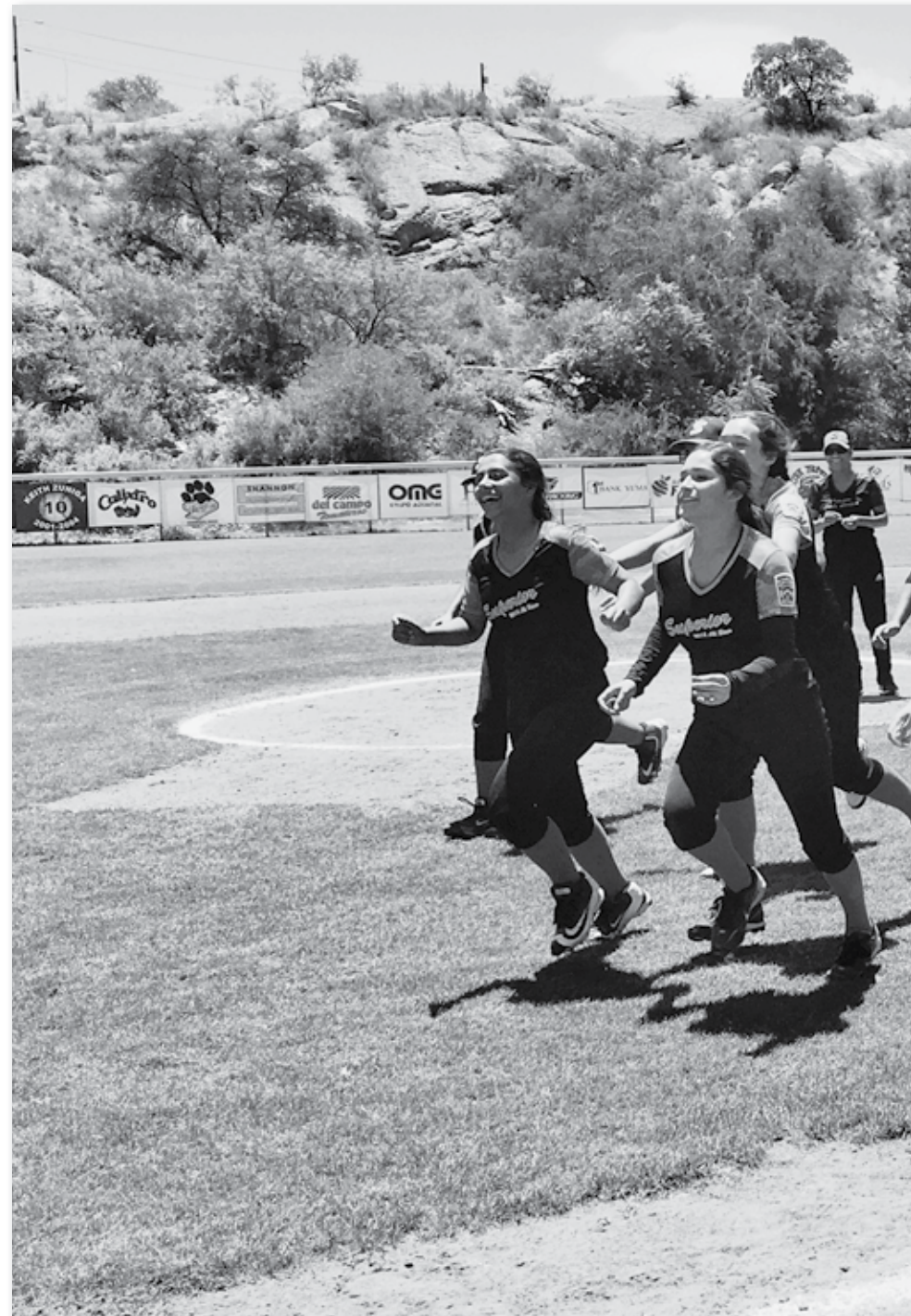
Excitement from the Superior Softball Team as they won the Arizona state championship.