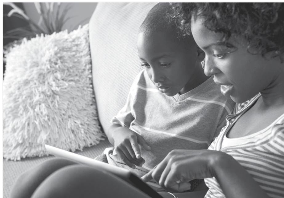
It's important for kids to read over the summer to keep their skills sharp for the next school year.