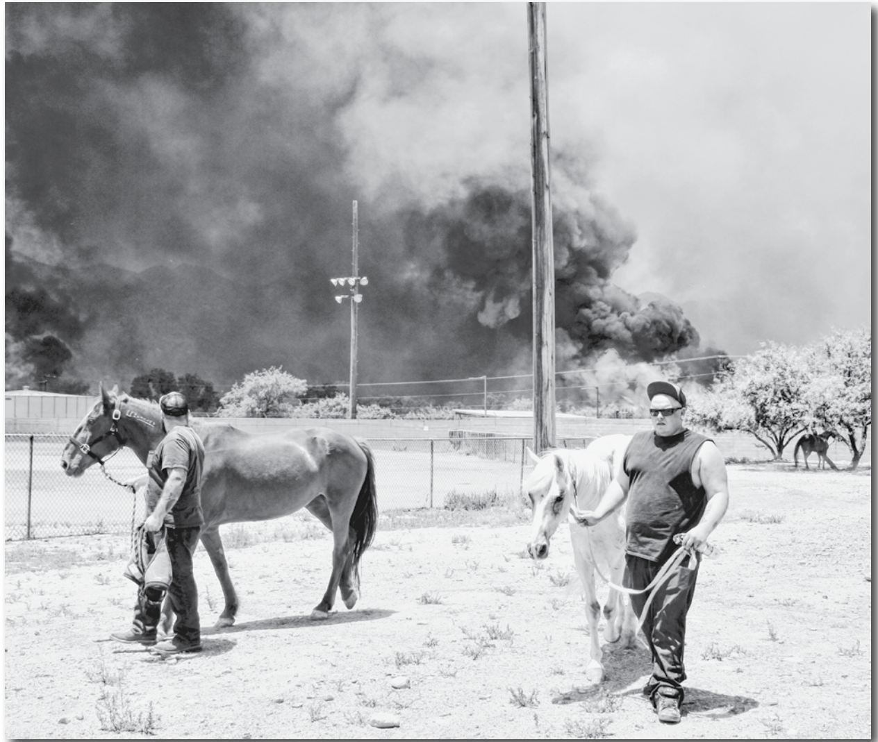
Residents work to move horses to safe area after a fire breaks out behind the Kearny Corrals.

If anyone has information about the suspicious origin of the fire, please call the Pinal County Sheriff's Office at 520-866-5111.