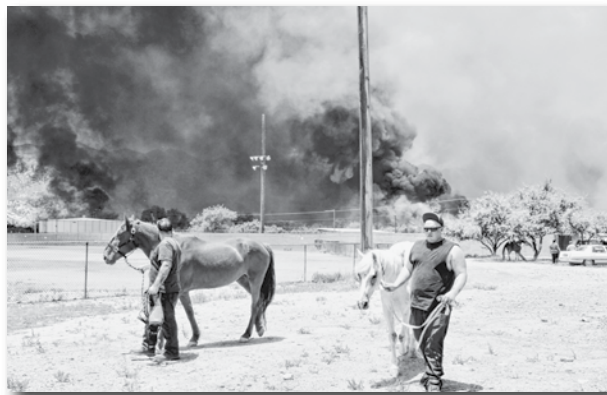
Residents work to move horses to safe area after a fire breaks out behind the Kearny Corrals.

The blaze burned for three days and forced the evacuations of 300 Kearny residents. Five structures