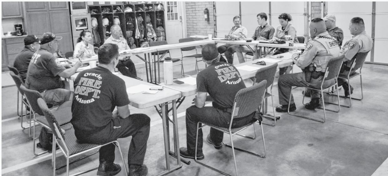
First Responders work on wildfire plan in Oracle last week.

The Oracle Fire Department will be having more Wildfire planning meetings in preparation for what Chief Southard believes will eventually happen, a major wildfire. Oracle is a high risk fire area and it is not a matter of if it will happen but when.