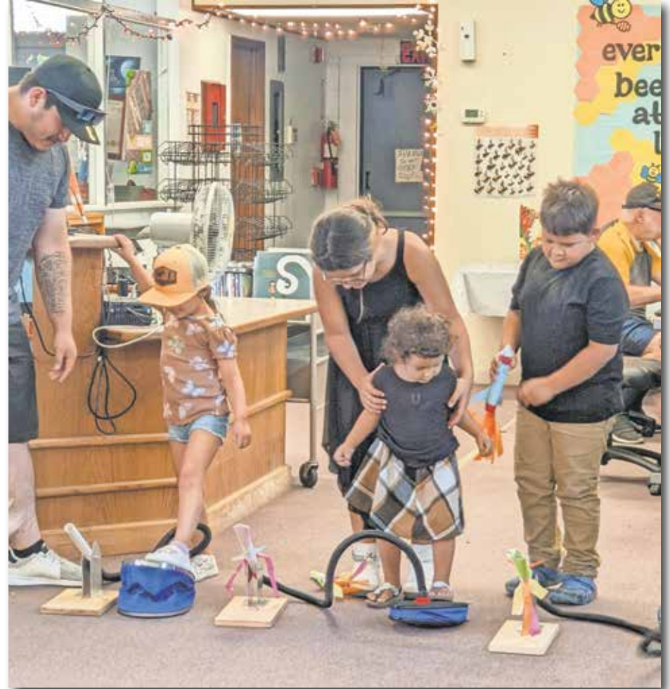
The Hayden Library had the Arizona Science Center brought Stomp Rockets to the library on July 7. Kids made their rockets out of paper and launched them using foot-powered air pumps.