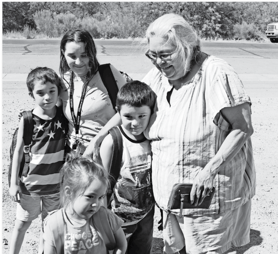
Family First Family Diaper Bank Monday hosted the annual Hot Diggity Dogs. Kids who attended received a hot dog, chips, drink and a backpack filled with school supplies. Families from the Copper Basin including this sweet family from Winkelman were able to participate.