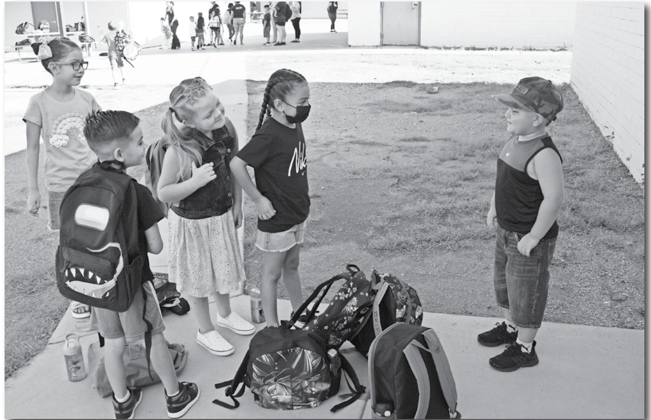
It's nearly time for the kiddos to head back to school. Are you ready?