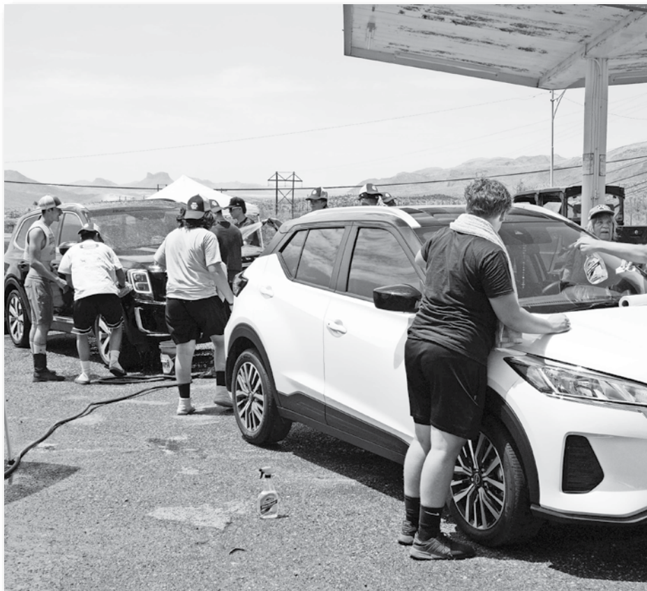
The Ray Bearcats Football Boosters hosted its first Car Wash Fundraiser earlier this month. NAPA Auto Parts played host for the football players and Booster Club members willing to clean cars for a great cause.