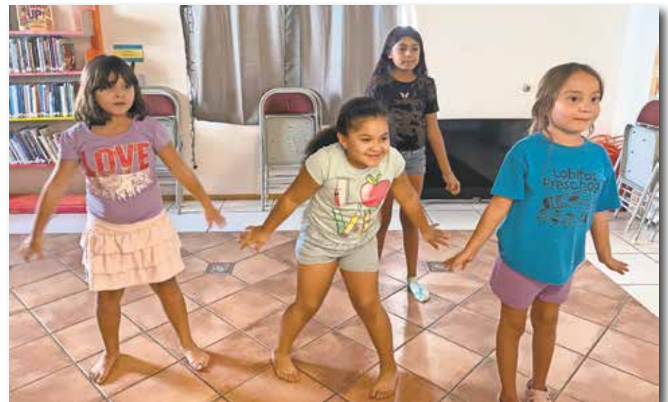
Several little girls got their groove on July 11 at the kids ZUMBA class, which is held every Tuesday and Wednesday from 5-5:30.