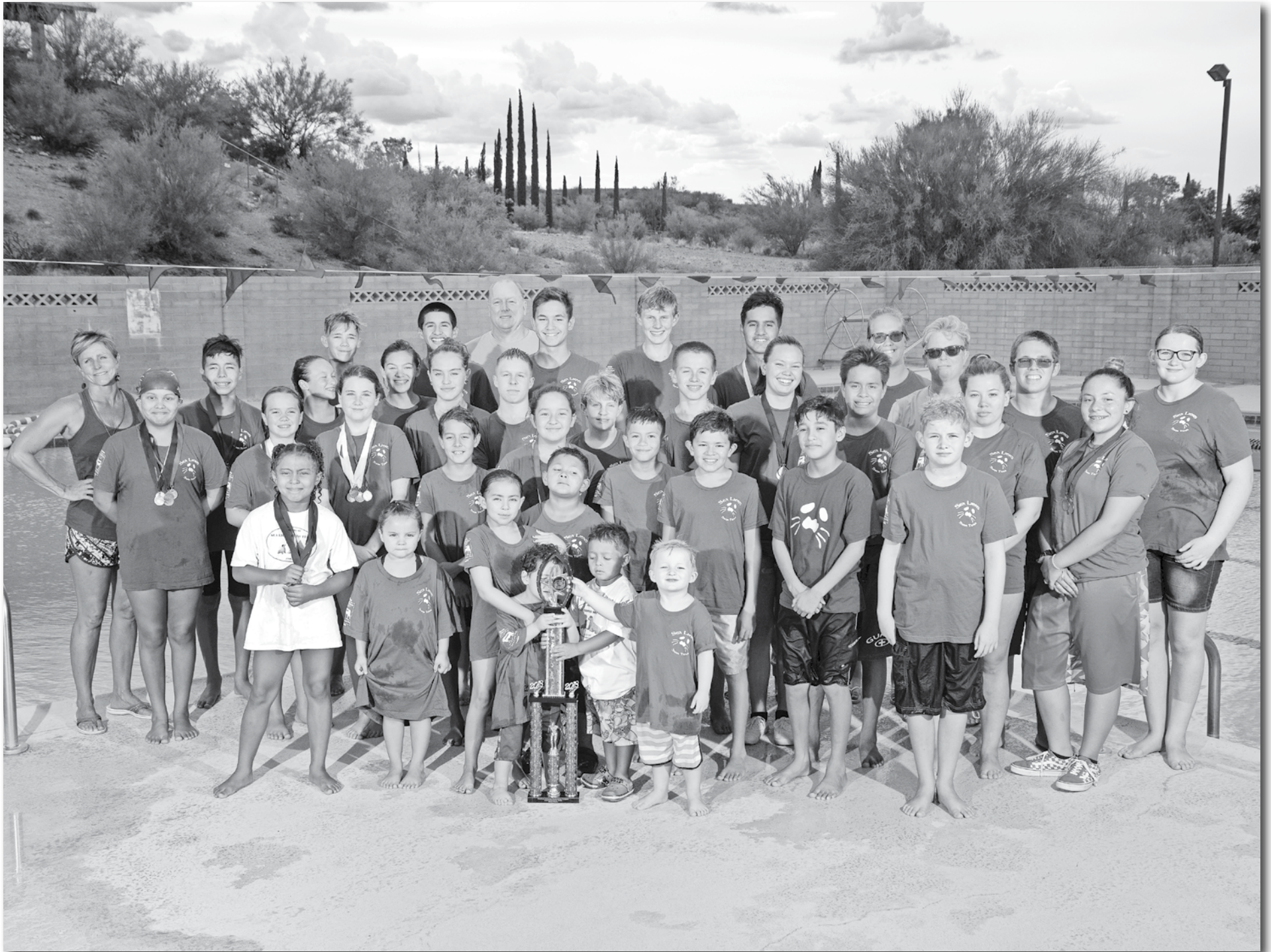
The 2018 Sea Lions Championship Team.

One of the most fundamental goals of the Sea Lions team is for swimmers to keep improving. Swimmers had many personal best times. The following 18 Sea Lions Swimmers