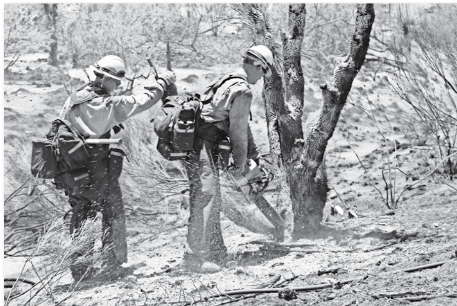
Oracle Fire Department and other agencies battled a small wildfire south of Oracle on SR77 earlier this month. The rains are helping prevent more wildfires, but caution is still needed.

Fire conditions as well as localized closures and restrictions are subject to change. Because tribal, federal, state, and local mandates are different, they may have some differences in their year-round regulations and restriction notices. For a more detailed explanation concerning agency restrictions and fire information in general, please contact the nearest land management agency office where you plan to work or play, visit http://wildlandfire.az.gov or call the toll-free Southwest Fire Restrictions Hotline at 1-877-864-6985.