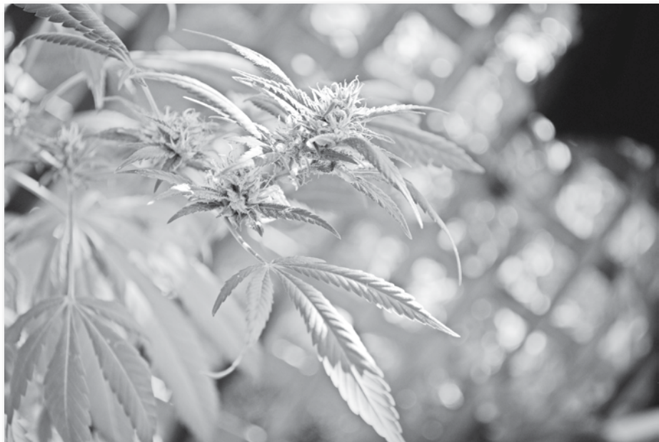
Thirty out of 50 states have legalized the use of medical marijuana.