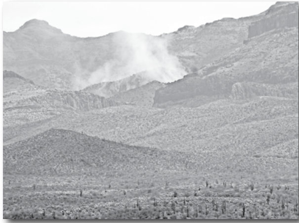
A brush fire in the Galiuros above Mammoth was caused by lightning. The photo was taken just before the July 4th holiday.