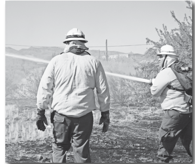
Firefighters work to extinguish a brush fire near Kearny earlier this summer.