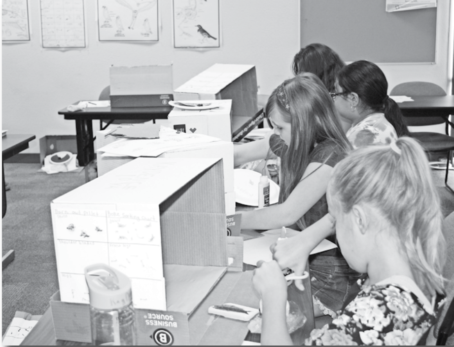
These College for Kids students are hard at work on their projects. The summer program keeps kids learning even while they are away from their classrooms.