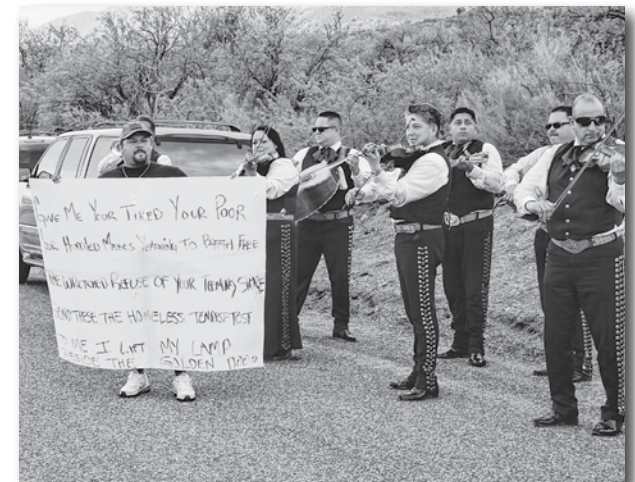
Mariachi Luz de Luna from Tucson also attended the protest, at one point surrounded by protesters.