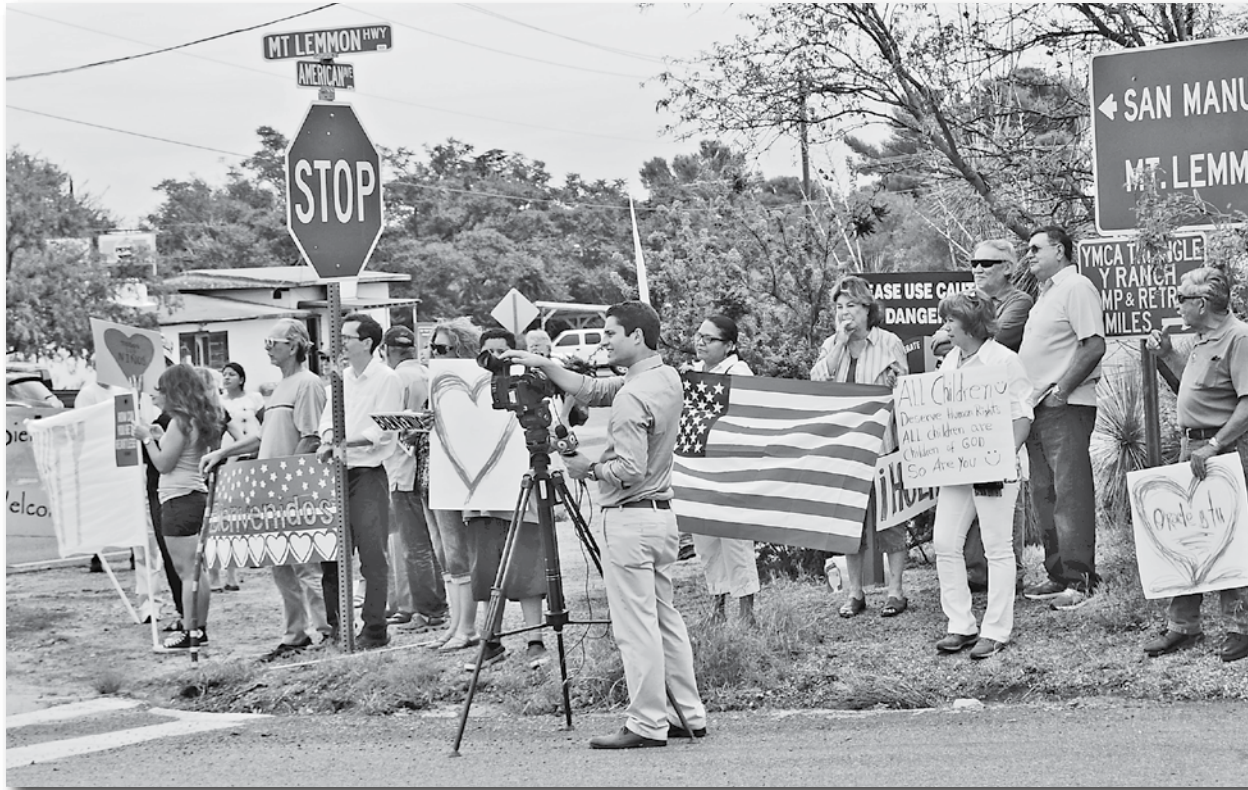
On the other side of the immigration issue, many folks turned out to welcome the young unaccompanied illegal immigrants to the community.