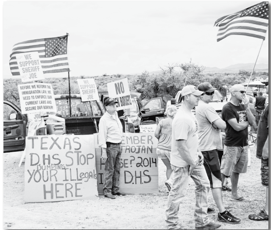
Protesters in opposition to a plan to house unaccompanied illegal immigrant children at Sycamore Canyon Academy.

Do you have an opinion on this subject? Go online to www.FB.com/CopperArea and join the conversation.