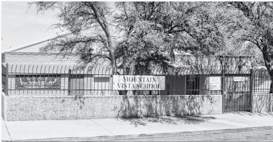
Preschoolers will attend school at Mountain Vista School in Oracle.

Quality early education is vital to students' long term success in school. Children taught at an early age usually benefit in the following ways: improved social skills, less or no need for special education instruction during subsequent school years, better grades, and enhanced attention spans. Likewise, some researchers have concluded that young children enrolled in pre-school programs usually graduate from high school, attend college, have fewer behavioral problems, and do not become involved with crime in their adolescent and young adult years. For more information contact the Oracle School District office at 520-896-3072 or visit our website at www.osd2.org .