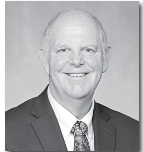
Representative Tom O'Halleran