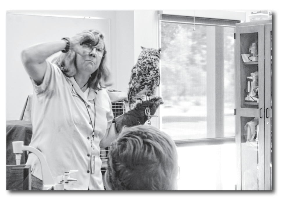
An officer with Arizona Fish and Games introduces students at this year's College for Kids students to one of the desert critters.

Please join us on Facebook, Twitter or LinkedIr