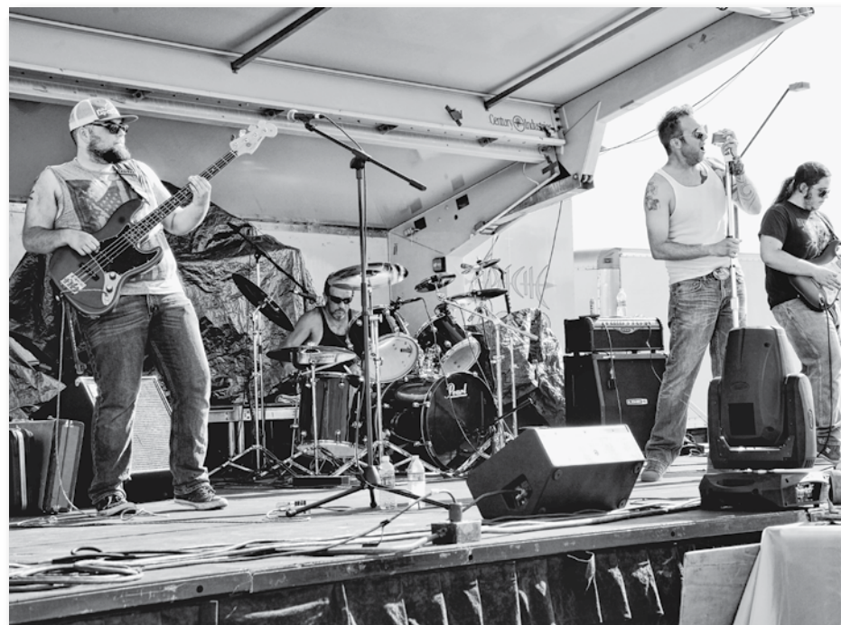
Low Expectations is pictured above playing at Apache Gold Casino on July 3. The group will be headlining this weekend’s Copper Triangle Tour which will include shows in Miami, Superior, Kearny and Globe.

Come out and support local music this weekend!