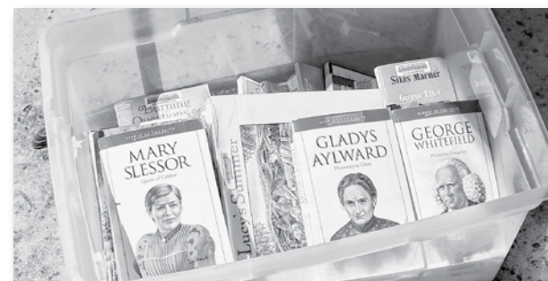
A portion of the books donated by Cornerstone Christian Academy. All kids who pass through Kids’ Closet receive a book. Areas served include Kearny, Winkelman, Hayden and Dudleyville.