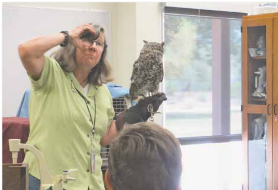
An officer with Arizona Fish and Games introduces students at this year's College for Kids students to one of the desert critters.