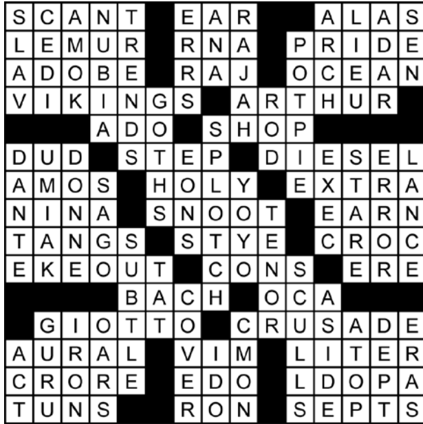
Solution to puzzle on page 11.

with the book selection for the children who visit the Closet. Each child is invited to select two books with each visit to the Closet. Elizabeth decided to turn the June food collection into something a bit larger. Called "Feed the Mind and Body" program, she requested food and books suitable for the youngsters in age groups up to 8th grade.