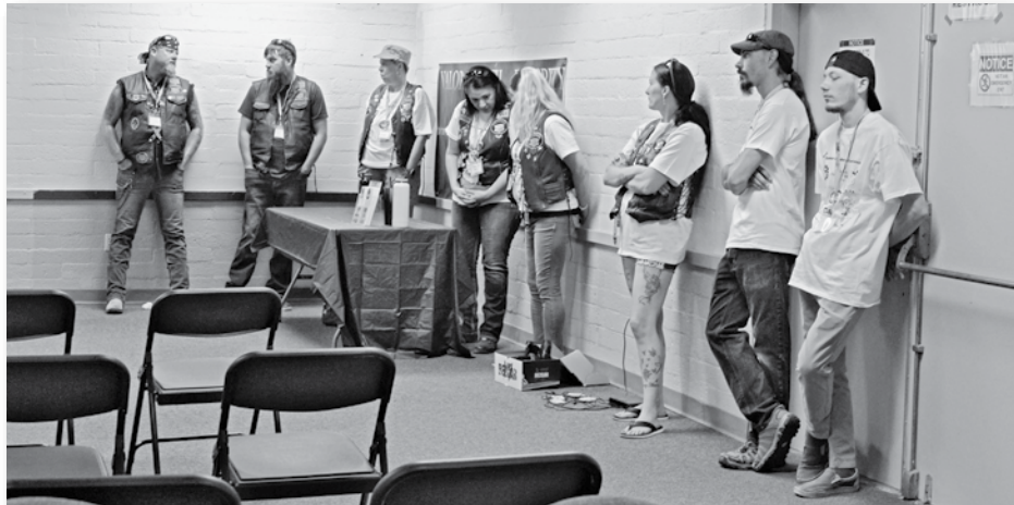
Volunteers for the Leadership Conference included the Guardians of the Children.