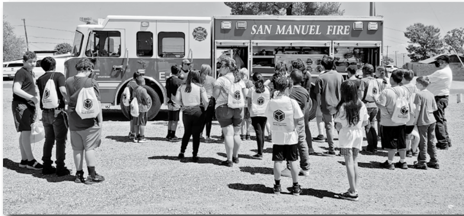
Checking out the San Manuel Fire Truck.