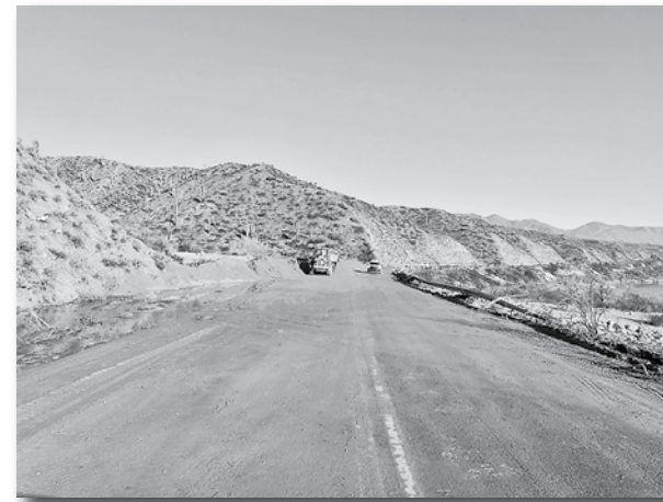
ADOT crews clean up after a flash flood in 2020 on State Route 188.