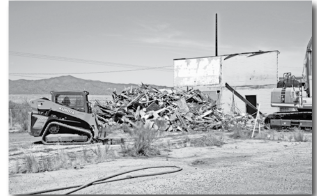
A motel in Hayden was demolished thanks to a brownfields grant.