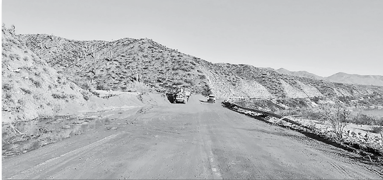
ADOT crews clean up after a flash flood in 2020 on State Route 188.