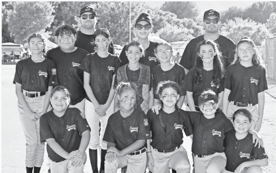
Superior Minors All-Star Softball Team.