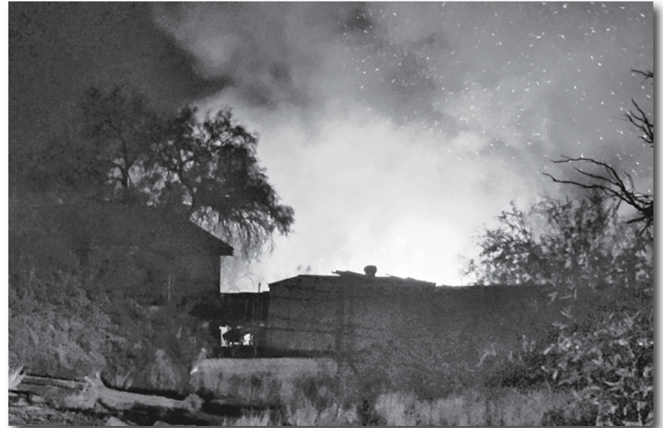
At the scene of the Roach Fire in Dudleyville. Superior and Queen Valley Fire Departments each sent a brush truck to assist in fighting the fast moving fire.

Copper Area News would like to thank our readers for helping us get the word out about the Roach Fire. We especially thank those who sent us photos and video from the scene.