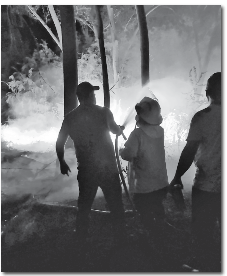
Residents and firefighters battle the Roach Fire at the back of the Donna Woods property.

By midnight Friday, 100 families were evacuated; 500-600 were without power; and 300 homes were without gas.