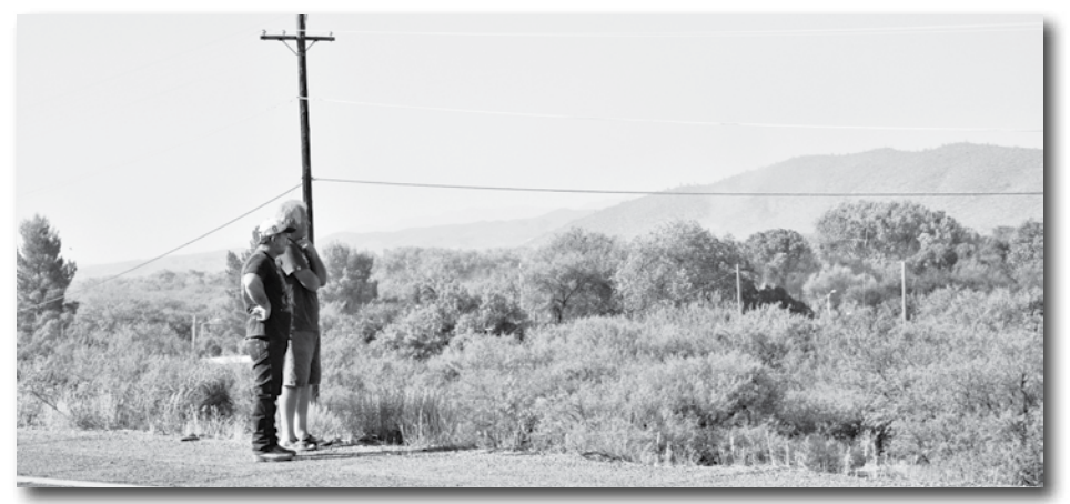
A couple of residents view the fire results and wait until they can return to their homes.