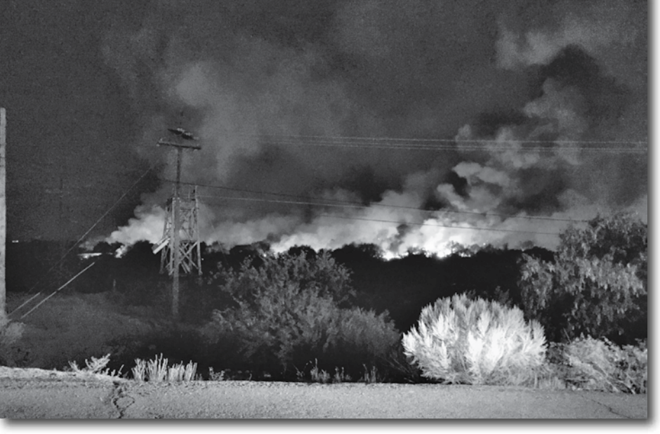
A view of the Roach Fire from the parking lot of the Dudleyville Giant.