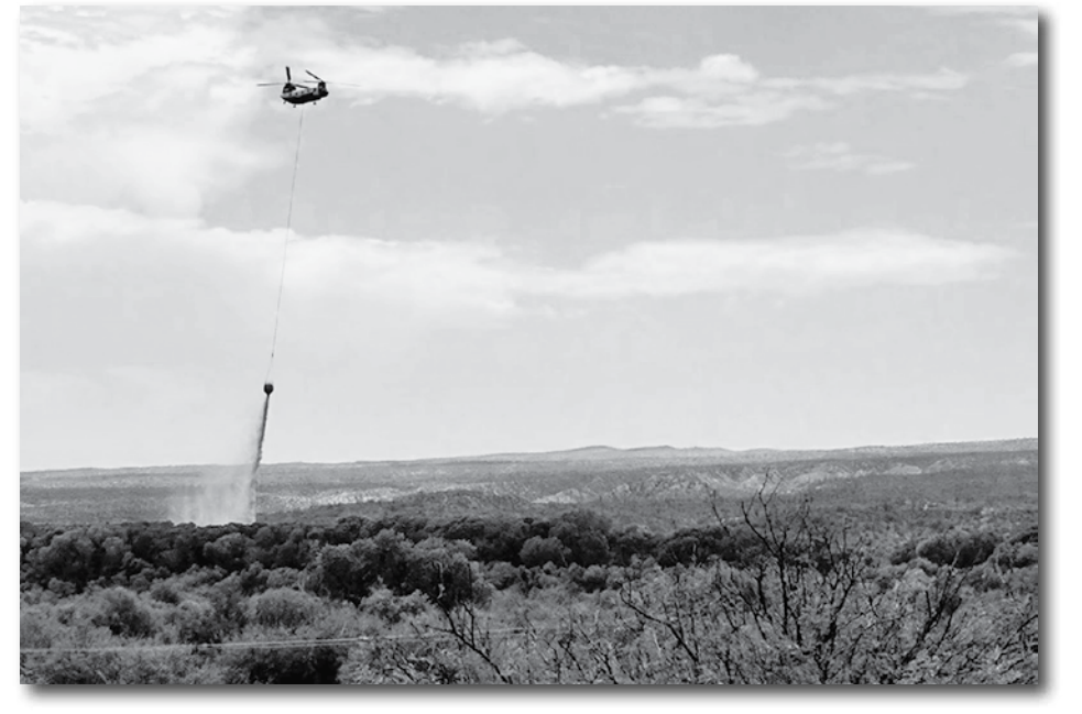
A Chinook helicopter drops a load of water on the Roach Fire.

Copper Area News would like to thank our readers for helping us get the word out about the Roach Fire. We especially thank those who sent us photos and video from the scene.