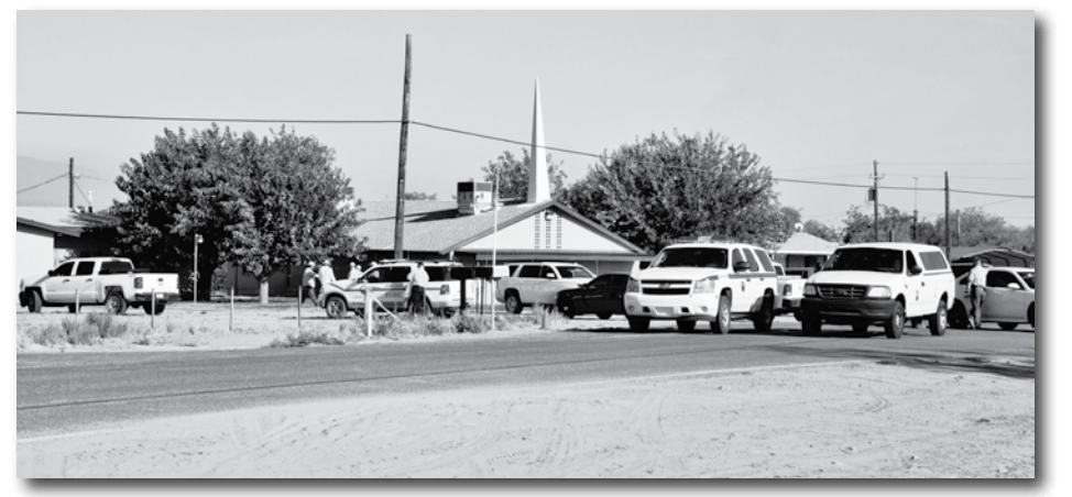
Command center at the San Pedro Valley Baptist Church in Dudleyville.