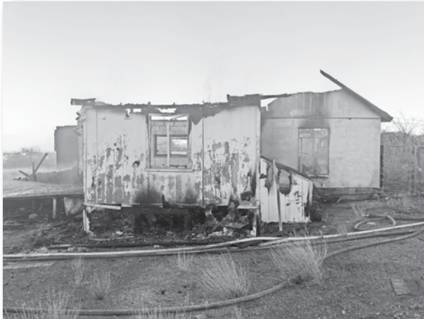
Photos of the house fire near Edna and Martin streets.