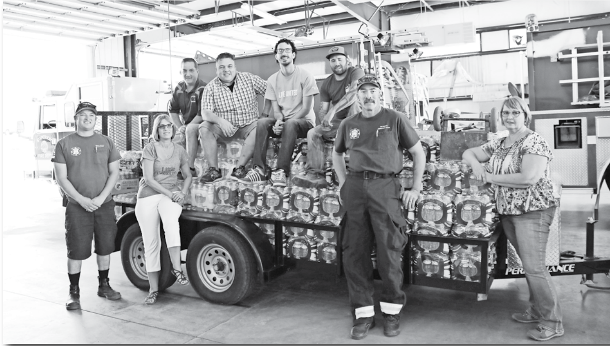
United Way of Pinal County made a special delivery of water and other snacks to the Superior Fire Department. Oracle Fire Department received a similar delivery as part of the Heat Relief Network.