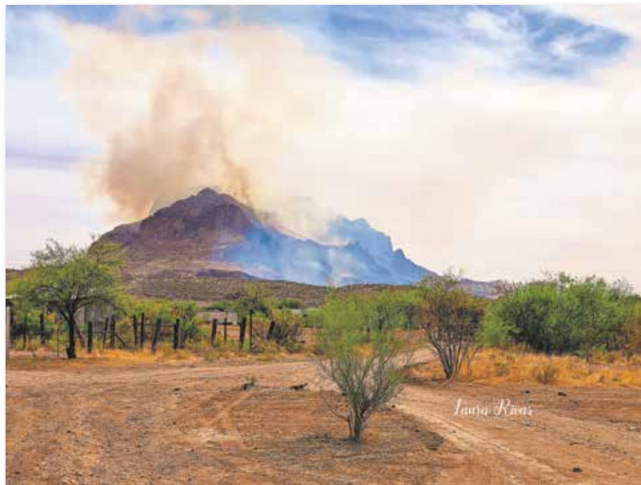
The Telegraph Fire burns near Superior. The fire at press time is zero percent contained with more than 70,000 acres burned. Laura Rivas | Submitted

Keep up to date with road closures and fire news on our Facebook page: www.facebook.com/copperarea .