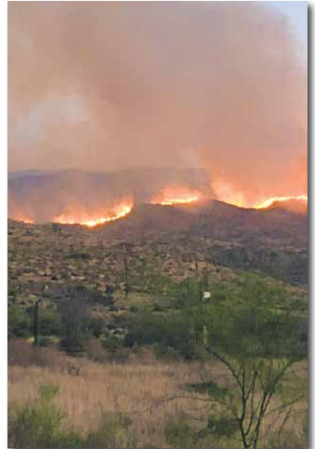
Retardant is dropped on the Telegraph Fire by air support. The blaze nearly burned the Arboretum but additional support came in to save the park.