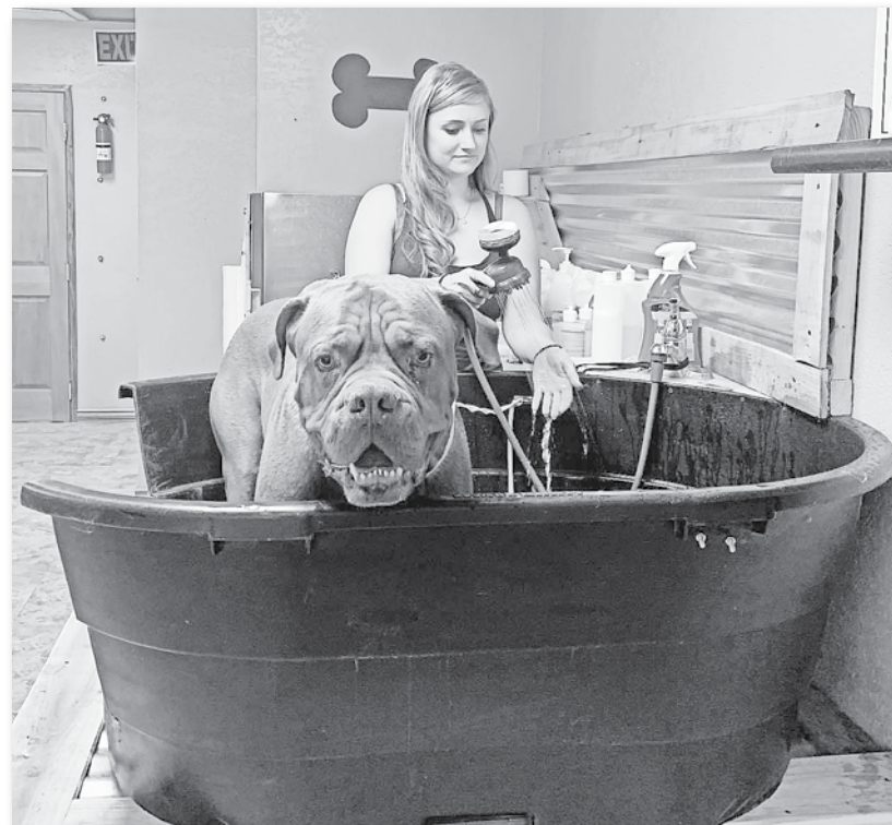
Mila Besich | Sun