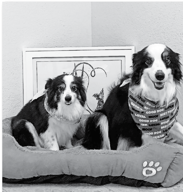
Some satisfied customers.