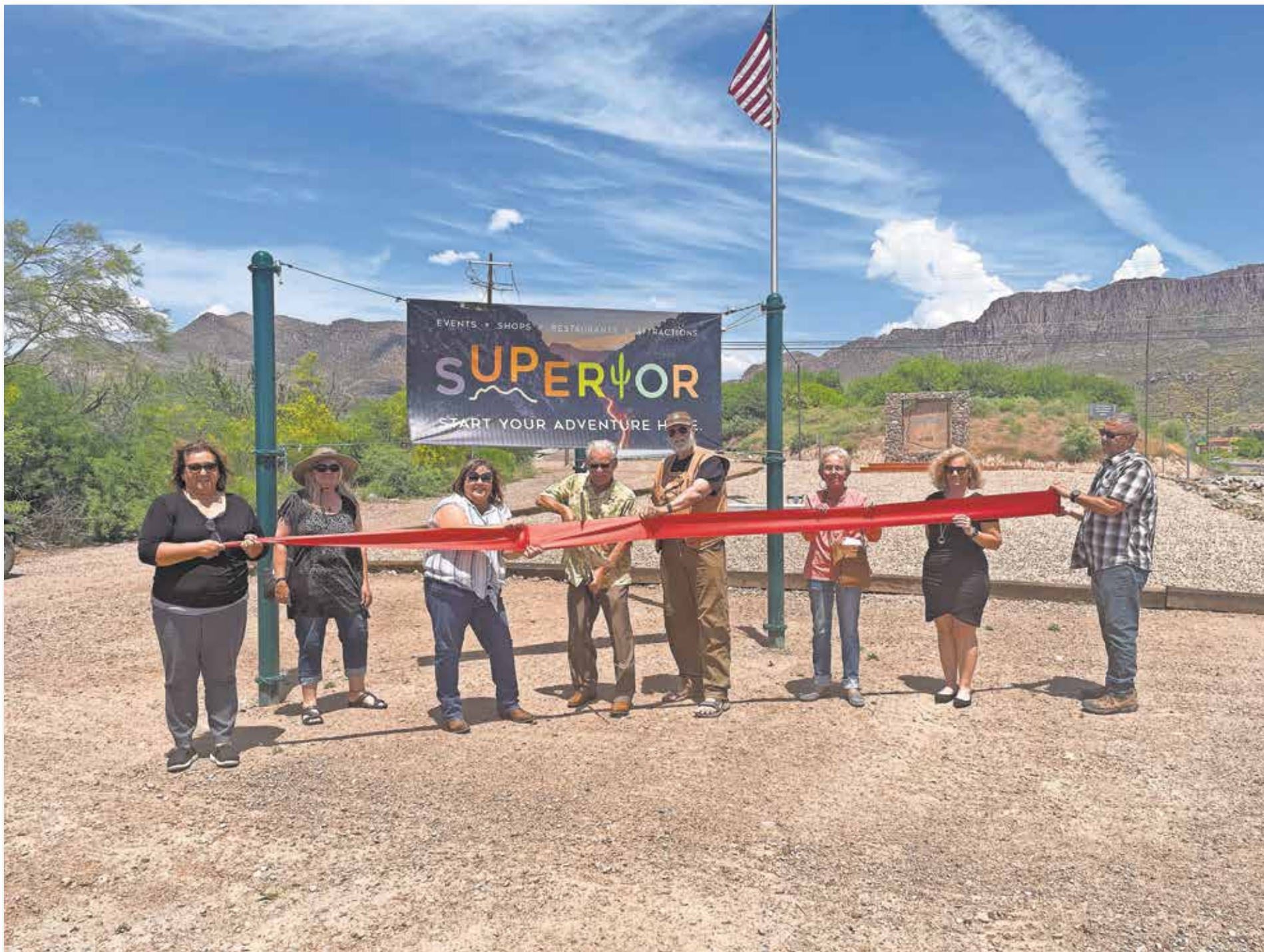
Officials from the Town of Superior and the Superior Chamber of Commerce were on hand to officially reopen the Peace Park at the entrance to the town.

Local groups wishing to install banners on the new entryway banner location will need to submit a permit at the Town Hall.