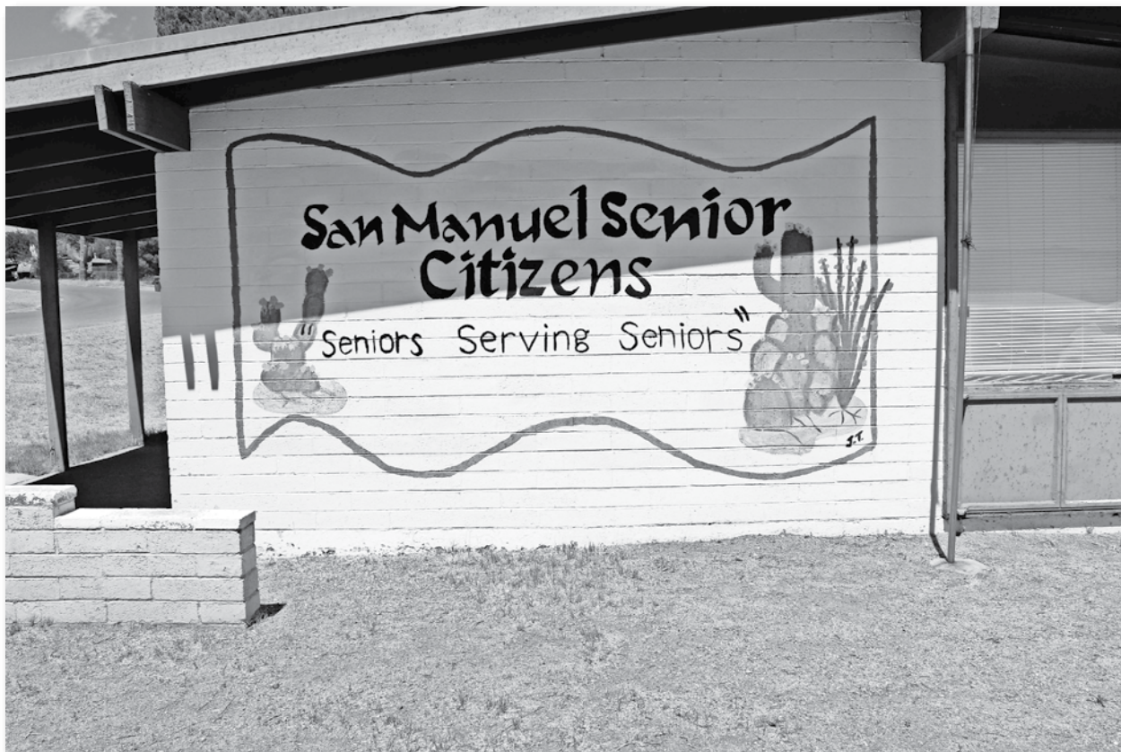
The outside of the San Manuel Senior Center will also receive some much needed attention with the creation of a parking lot and making the outside ADA compliant.