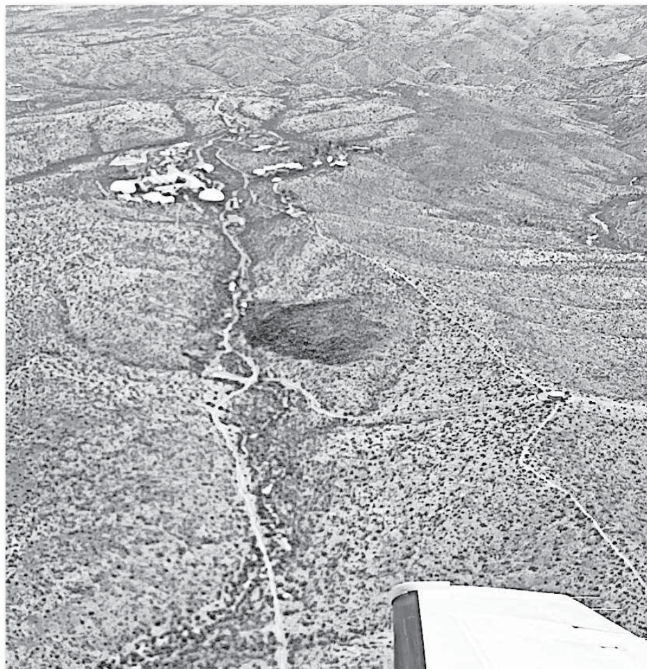
The site of the Biosphere 2 Fire can be seen as the darkened area at about the center of the photo. The photo was taken from the window of the spotter plane. The Biosphere 2 can be seen at the top of the photo.

As of Monday, approximately 30 personnel remained assigned to the incident.