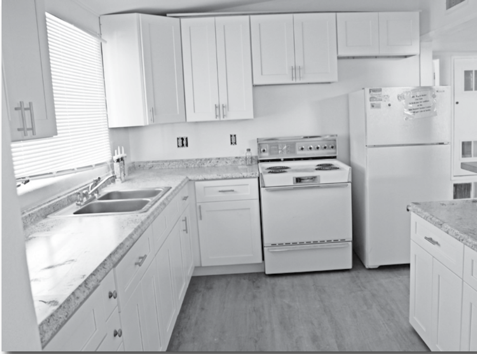
The kitchen at the San Manuel Senior Center is so bright and shiny and new. The seniors will begin using the newly renovated center soon.