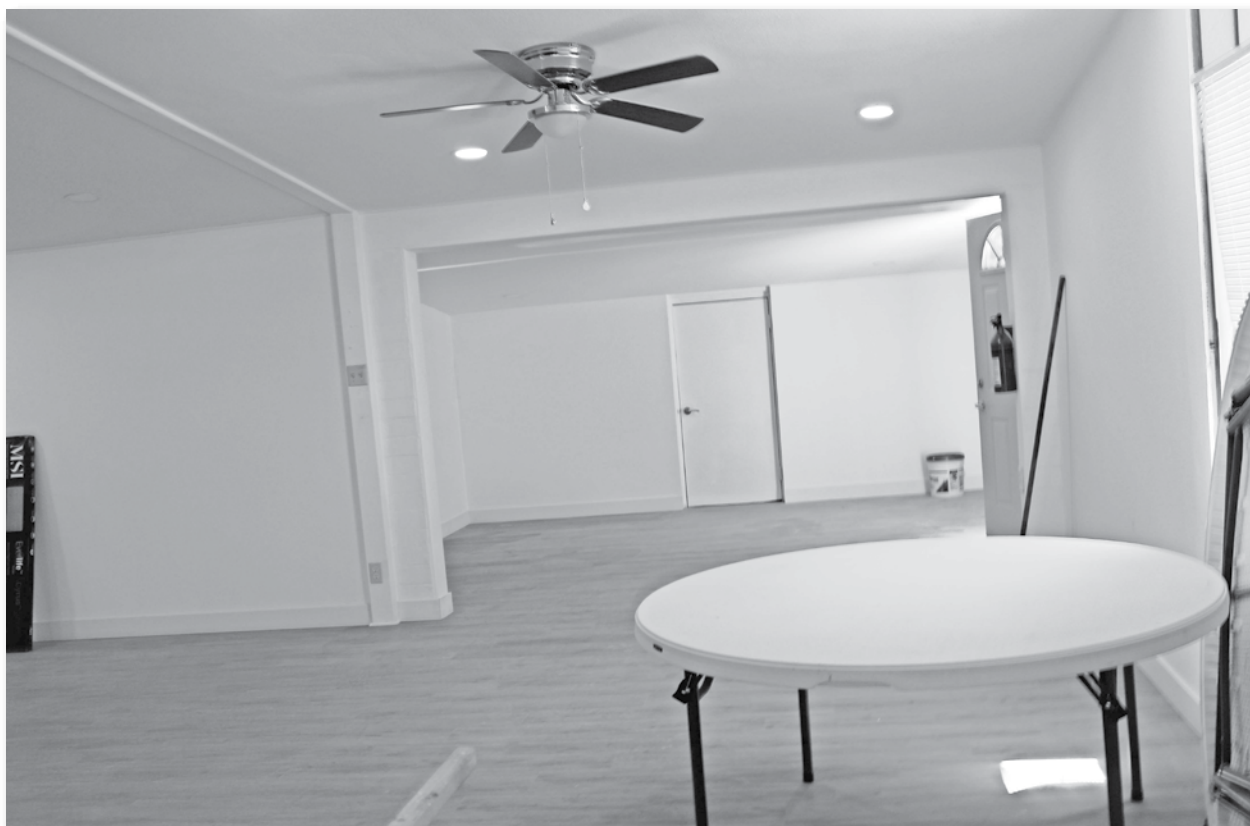
There will be lots of bright open spaces for San Manuel's Senior Citizens once the renovations are complete.