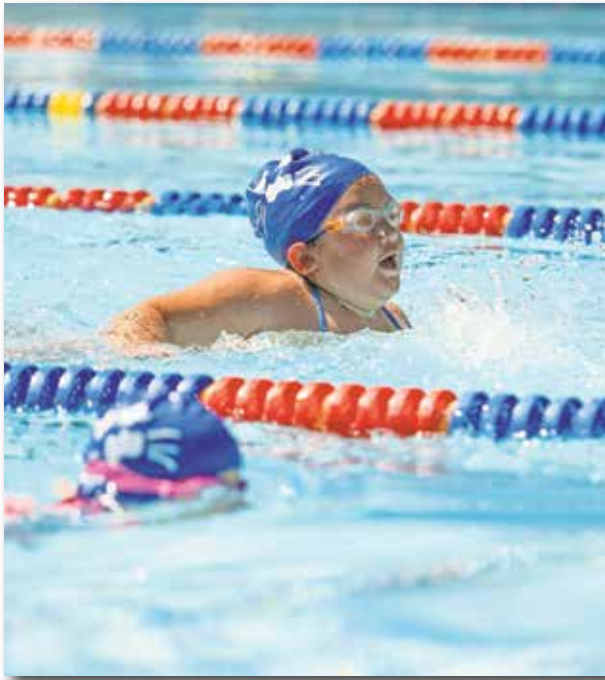
Savanna Laguna 6 under