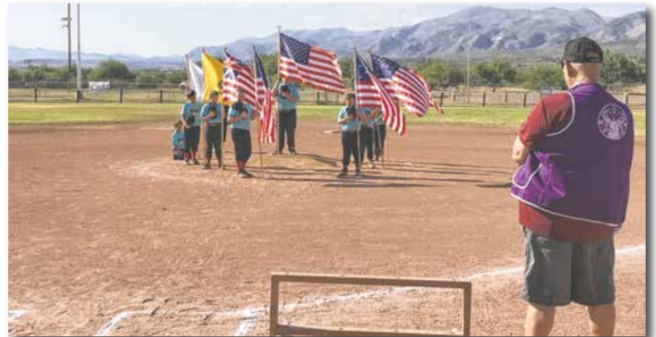
Members of the Kearny Little League Minors Team, the Desert Blues, work with the Kearny Elks to celebrate the history of the American Flag.