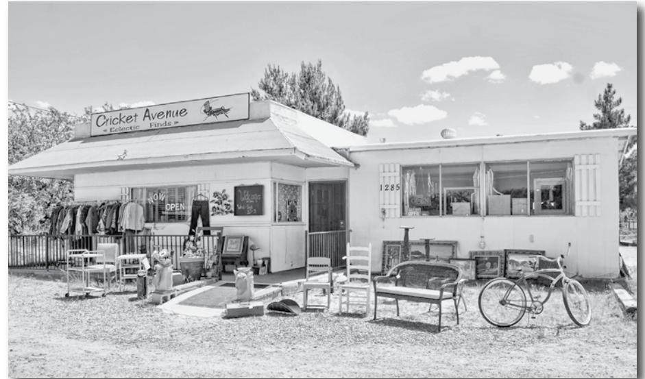
Eclectic items and vintage finds at Cricket Ave. in Oracle.