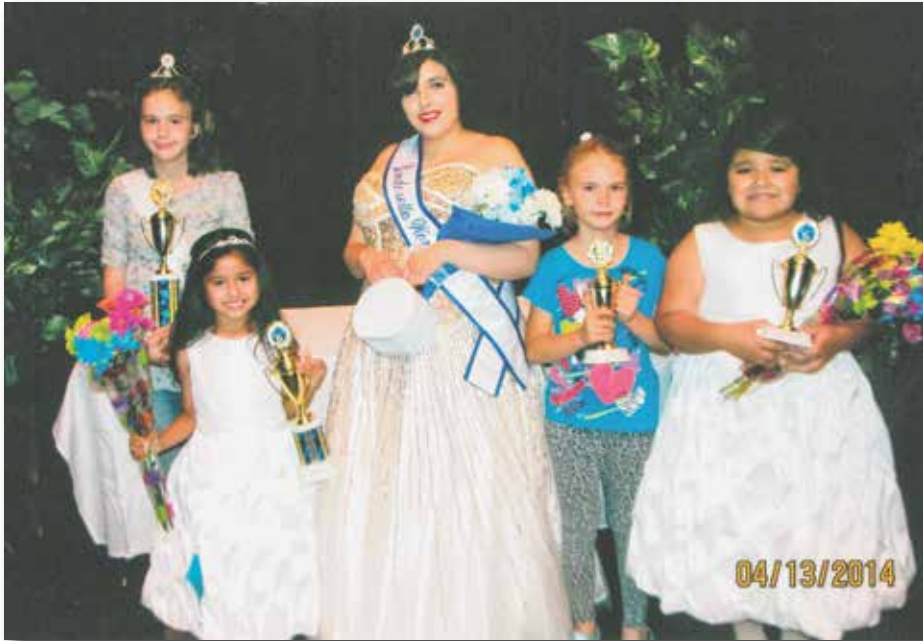
Young beauties compete in Cinderella Scholarship Pageant.