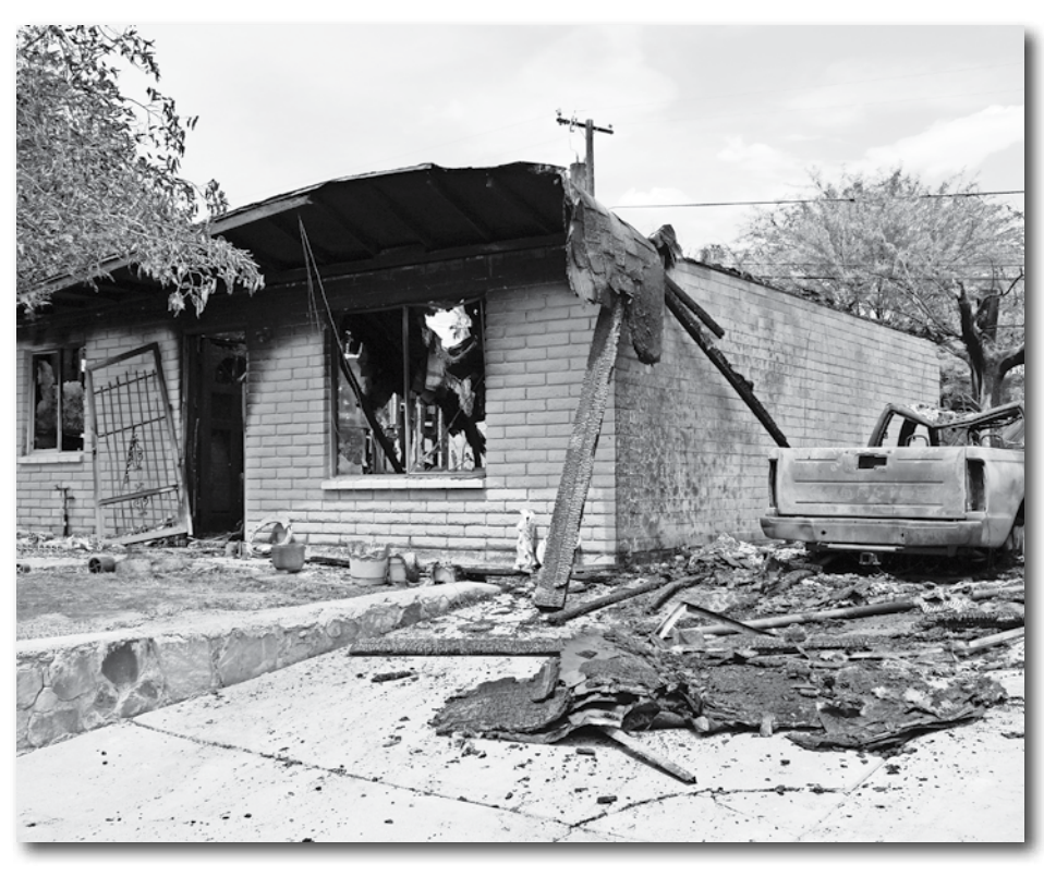
Two homes in the 400 block of Ivanhoe were destroyed in a fire early Sunday.