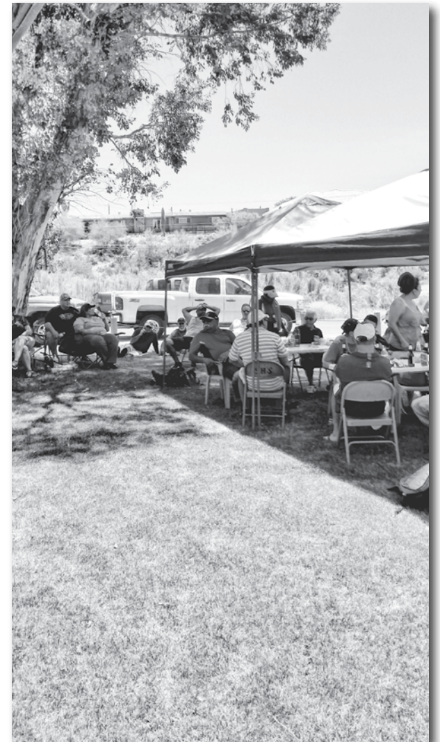
Golfers relax following last Saturday's tournament at Queen Valley Golf Course.