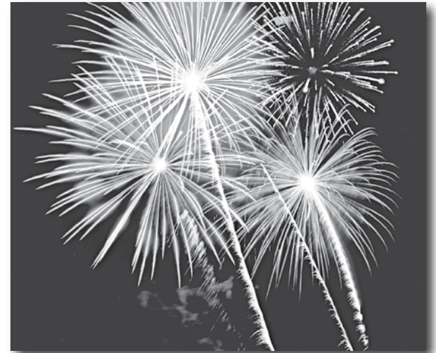
No fireworks this year for the Town of Kearny due to extreme fire danger.

Town of Kearny Administration wishes everyone a safe and happy 4th of July.