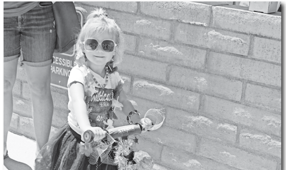
Bikes, cars, trucks or pogo sticks ... decorate them and sign up for the parade.