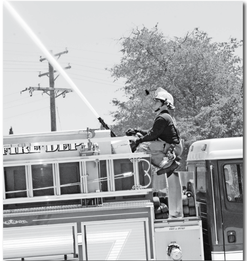
The Oracle Fire Department will provide some much needed relief from the July Arizona heat at the Oracle Community Center's July 4th event.