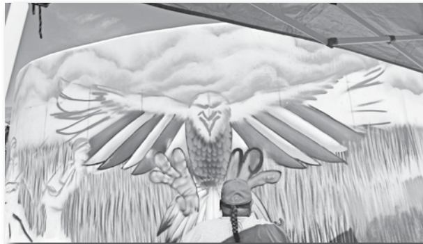
Sonny Cruz’s work of art is taking shape.