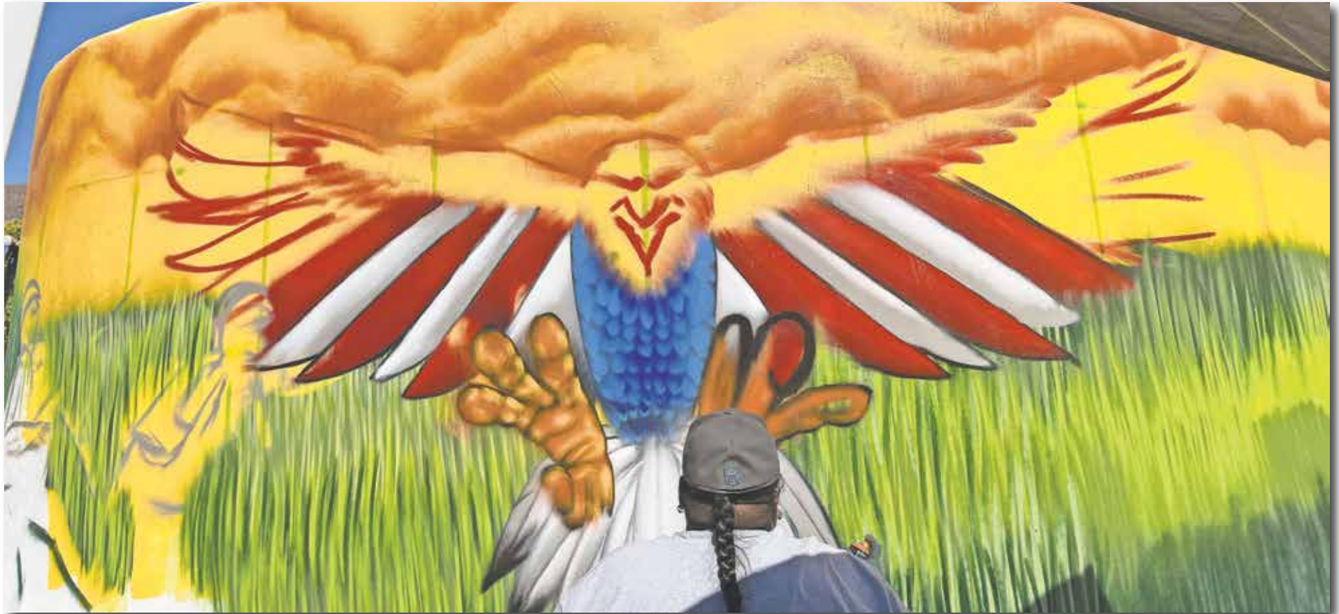
Sonny Cruz is transforming a once blank wall at the Superior Cemetery into a patriotic work of art.