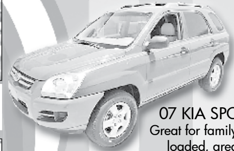
07 KIA SPORTAGE Great for family trips! 4dr, loaded, great MPG! $8,295