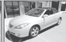
06 Toyota Solara Convertible Your dream car! SE loaded, 100K, a beauty! $11,995