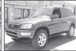
00 Toyota RAV4 Love my mini SUV! Loaded, low miles! $6,995