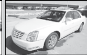
11 Cadillac DTS Ultimate luxury, leather, 35K miles! $31,995