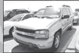
04 Chevrolet Trailblazer LS Auto, 4WD, all power, nice SUV! $8,495