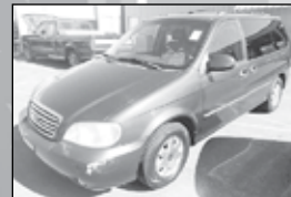
02 Kia Sedona 77K, leather, all power, great condition! $5,995