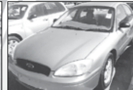
07 Ford Taurus SE Gold, 4dr, CD, senior-owned, nice. $7,495