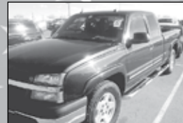
05 Chevrolet Silverado LS 4WD Super clean, all power CD, ext cab, 104K! $11,495

Ask about our Fast Track acquisition available to Ray FCU Members. Not a member? Join today!