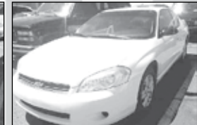
06 Chevrolet Monte Carlo Very sporty! Super clean! AC, CD, tint! $7,495