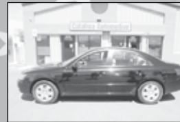
08 Hyundai Sonata Loaded, 51K, AC, cruise, tilt! $11,995