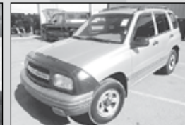
02 Chevrolet Tracker 4X4 Great 4dr mini-SUV! Great MPG & low miles! $6,995