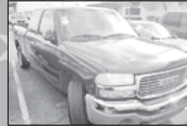
03 GMC Sierra 1500 Gray, 104K, 2WD, ext. cab, Loaded! $8,995