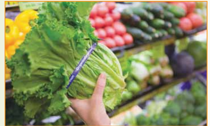
Try fresh organic produce this summer.

Another thing to look for is a fair-trade store. In this type of shop, products like chocolate and coffee may not necessarily be organic, but they are produced and marketed in a way that ensures a fair price to producers and their employees. However, many products are both fair-trade and organic. They benefit the environment and the quality of life of thousands of workers around the world.