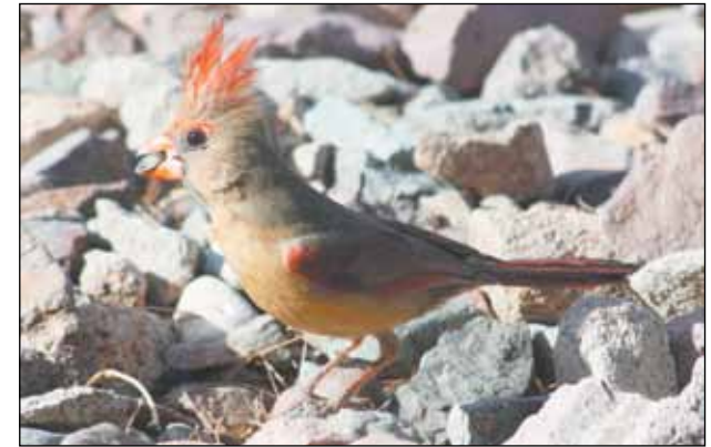
Protecting cardinals and other birds from window collisions is one way to make your garden more earth-friendly.

This spring, make your garden the envy of the neighborhood for more than just its beauty. With a few easy tweaks, you can reduce your family's waste and create a safe haven for birds and pollinators.