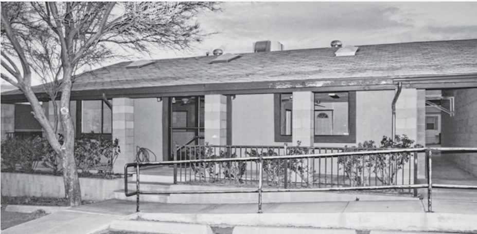
The location for the medical marijuana dispensary will be 1880 W. American Ave., Oracle.