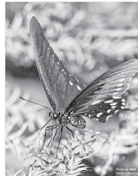
Pipevine Swallowtail butterfly

Q. Arboretum visitors saw a different side of your talents and interests last November - when did you start playing the fiddle? Where and when can readers here your band (Tri Rio) this month or in July-August?