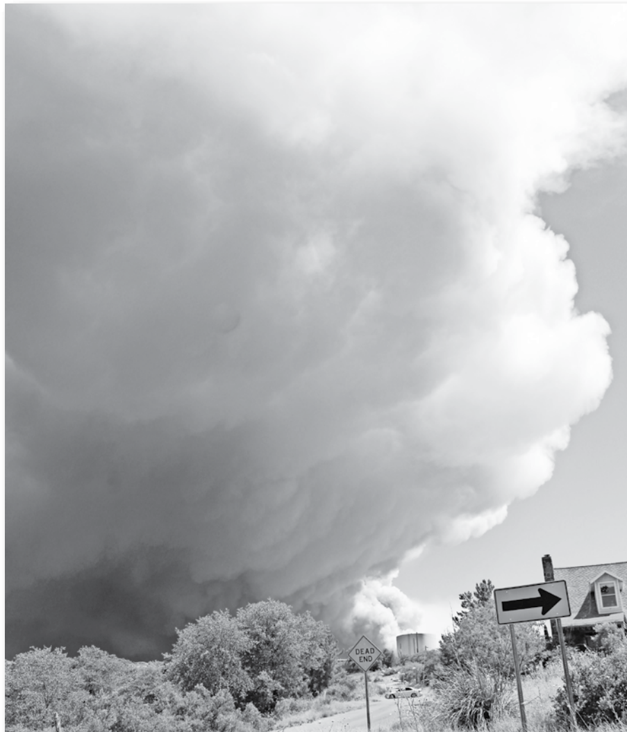
Smoke from the Bighorn Fire swelled over Oracle and San Manuel last Wednesday, lending an eerie light to the day.

"Stay Healthy, Return Smarter, Return Stronger"