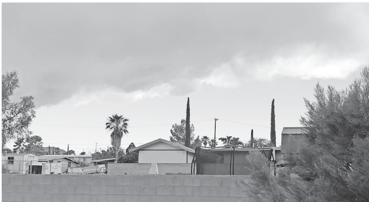
Smoke stole over San Manuel Wednesday from the Bighorn Fire.