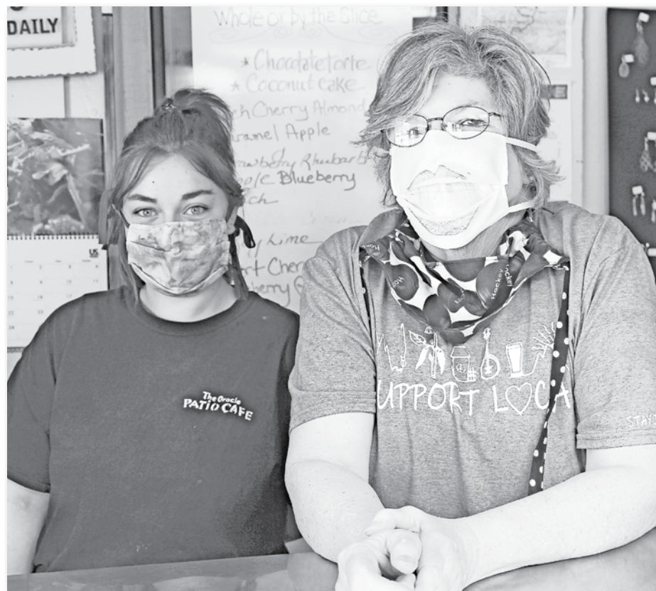
Masks are becoming more commonplace in the business environment. Above, employees of the Oracle Patio Cafe don masks while working with the public. At left, customers and cashiers alike wear masks to protect each other.

Want to SAVE MONEY Cooling and Heating Your Home?