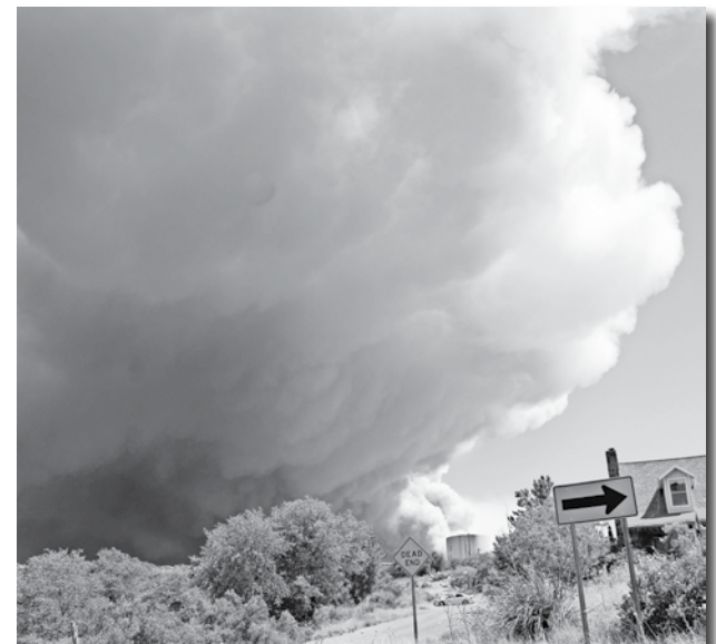
Smoke from the Bighorn Fire swelled over Oracle and San Manuel last Wednesday, lending an eerie light to the day.